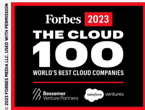
Forbes Cloud 100 list