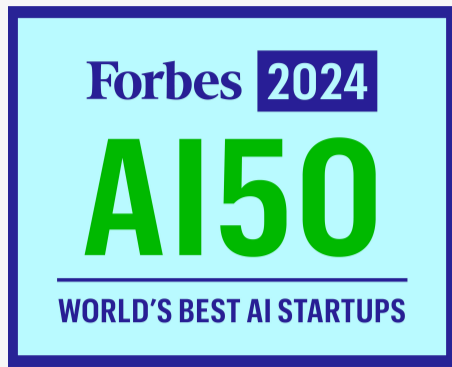
Forbes AI 50 list