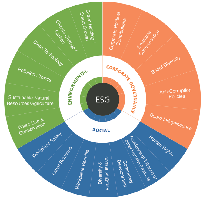
Figure 3: Examples of ESG Criteria

In 2021, the Morgan Stanley Institute for Sustainable Investing released a study entitled Sustainable Funds Outperform Peers during 2020 Coronavirus . The Institute found that in a year of extreme volatility and recession, funds focused on “on environmental, social and governance (ESG) factors, across both stocks and bonds, weathered the year better than non-ESG portfolios.” The research analyzed more than 3,000 US mutual funds and ETFs, finding that sustainable equity funds outperformed non-ESG peer funds by a median total return of 4.3 percentage points in 2020.