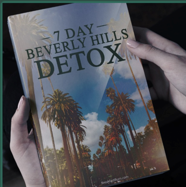
Bonus #1: 7-Day Beverly Hills Detox