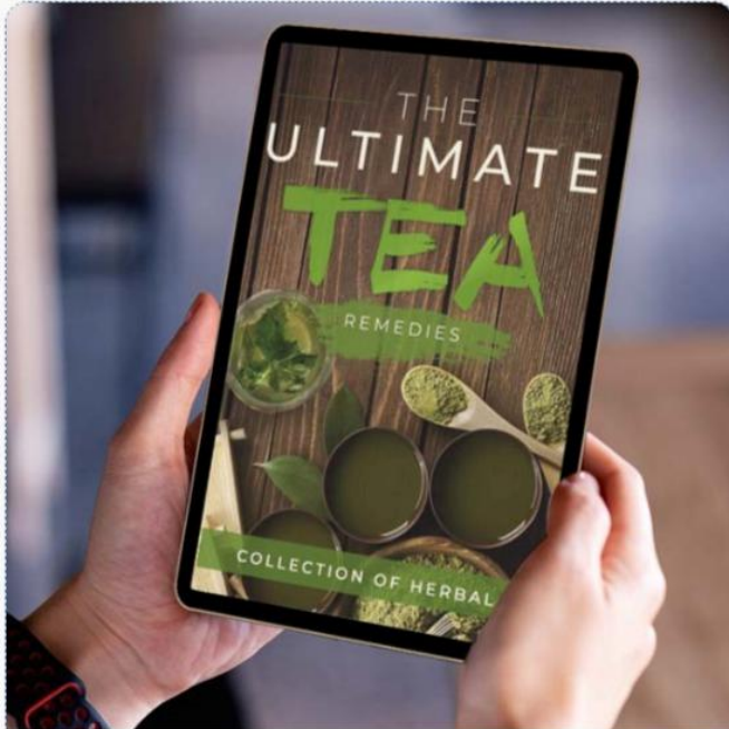
FREE BONUS #1 The Ultimate Tea Remedies (Instant download)

Order 6 Bottles or 3 Bottles and Get 2 FREE Bonuses!