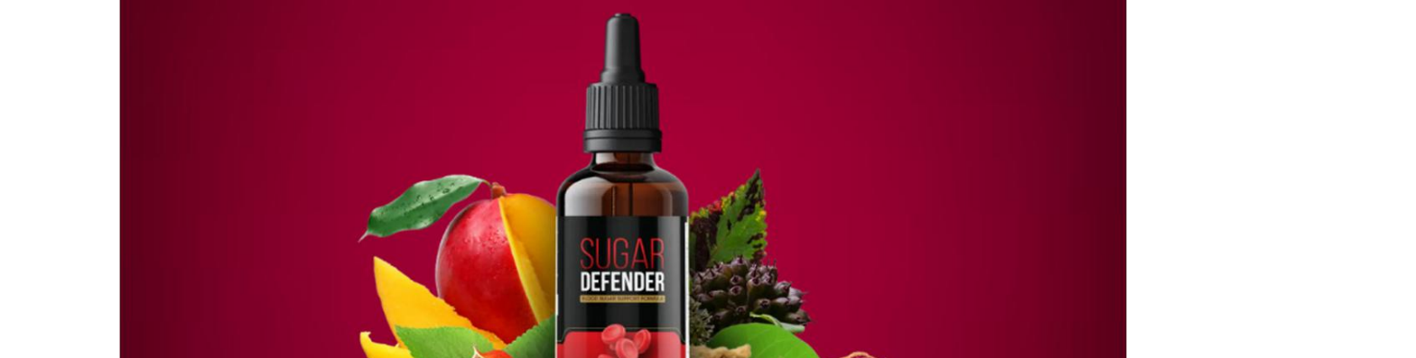
Sugar Defender Ingredients What are the ingredients in Sugar Defender and how should they be used?

Sugar Defender can be compared to a support system in the battle against high blood sugar. It will be determined by our review if the product lives up to its hype. Watch this space to find out if it is a real game changer or just another supplement that makes noise.