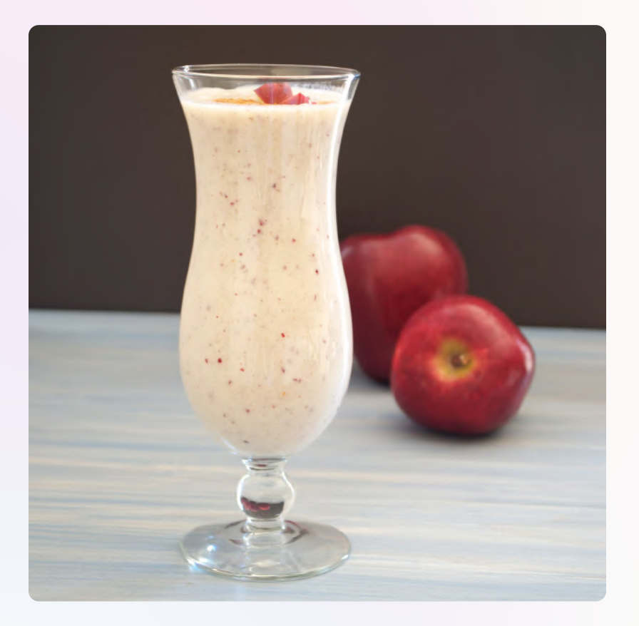
A delicious snack smoothie to enjoy during the 7-Day Smoothie Diet

This smoothie is packed with essential nutrients, including potassium, fiber, and vitamins. It's an excellent way to curb hunger cravings and boost your energy levels between meals throughout your smoothie diet plan.