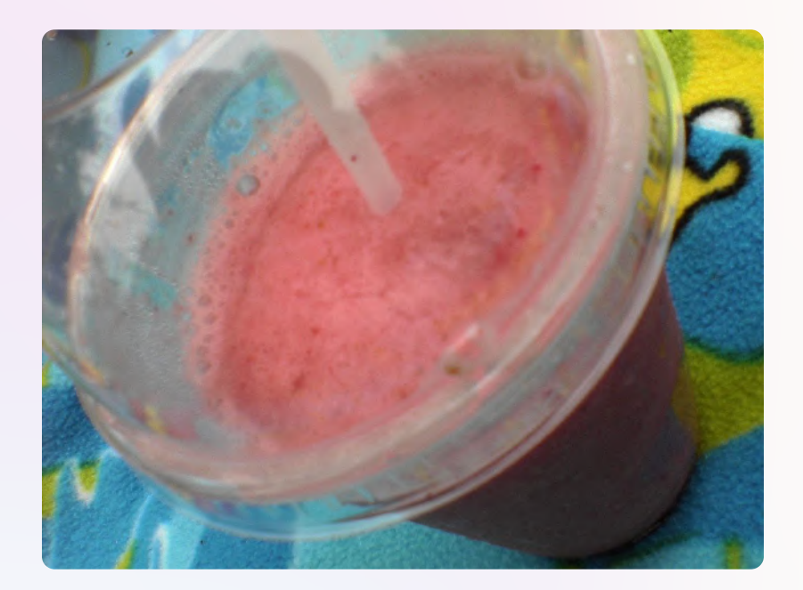
A glass of strawberry banana smoothie

For a refreshing and healthy snack, try this delicious smoothie recipe. Blend together a ripe banana, a handful of fresh strawberries, a scoop of Greek yogurt, and a splash of almond milk. Add a drizzle of honey for natural sweetness. This smoothie is packed with vitamins and nutrients, making it a perfect midday pick-me-up.