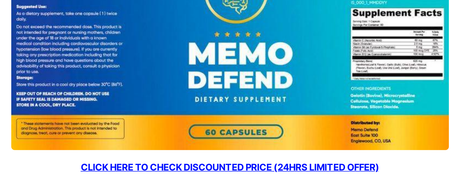
Does MemoDefend Really Work? Yes, it works really well. Memo Defend professes to assist anybody with reestablishing their memory

Niacin - It reduces stress and improves cognitive function.