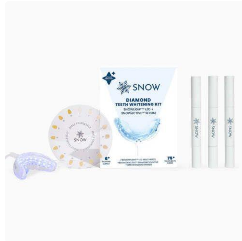
An illustration showcasing the Snow Diamond Teeth Whitening Kit

Formulated with precision and expertise, the Snow Diamond Kit ensures powerful yet gentle whitening, targeting wine stains specifically to bring out the natural radiance of your teeth. With easy-to-use application and noticeable results after just a few uses, it's the perfect choice for wine enthusiasts who refuse to compromise on the brightness of their smile.