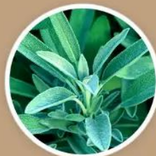
Sage & Vit. C