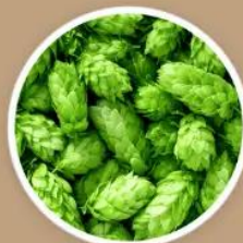
Hops & Vit. E