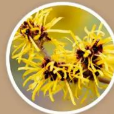
Witch Hazel & Horsetail