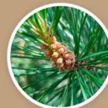
Lemon Peel & Scots Pine