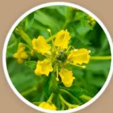
Graveolens & Hyaluronic Acid

CLICK HERE - OFFICIAL ILLUDERMA WEBSITE (24 HRS OFFER)