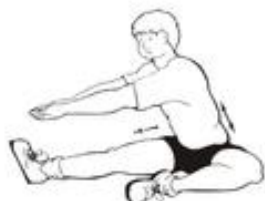
16. Hamstring Stretch (commence with knee slightly bent, then push knee straight as tension allows, push chest towards foot)