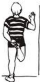
17. Quadriceps Stretch