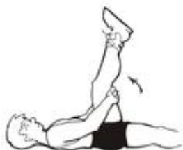
15. Hamstring Stretch (straighten leg) i. with foot pointed ii. with foot pulled back towards the knee