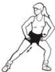
22. Adductor Stretch (keep foot pointing forward, lunge sideways on bent knee, keep back straight)