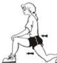
23. Hip Flexor Stretch (keep back straight, tuck the bottom under, lunge forward on front leg)