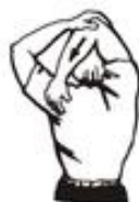
4. Triceps Stretch (pull elbow across and down)