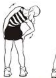
11. Lateral Flexion Stretch (one side, then the other, keep the pelvis across as you stretch)