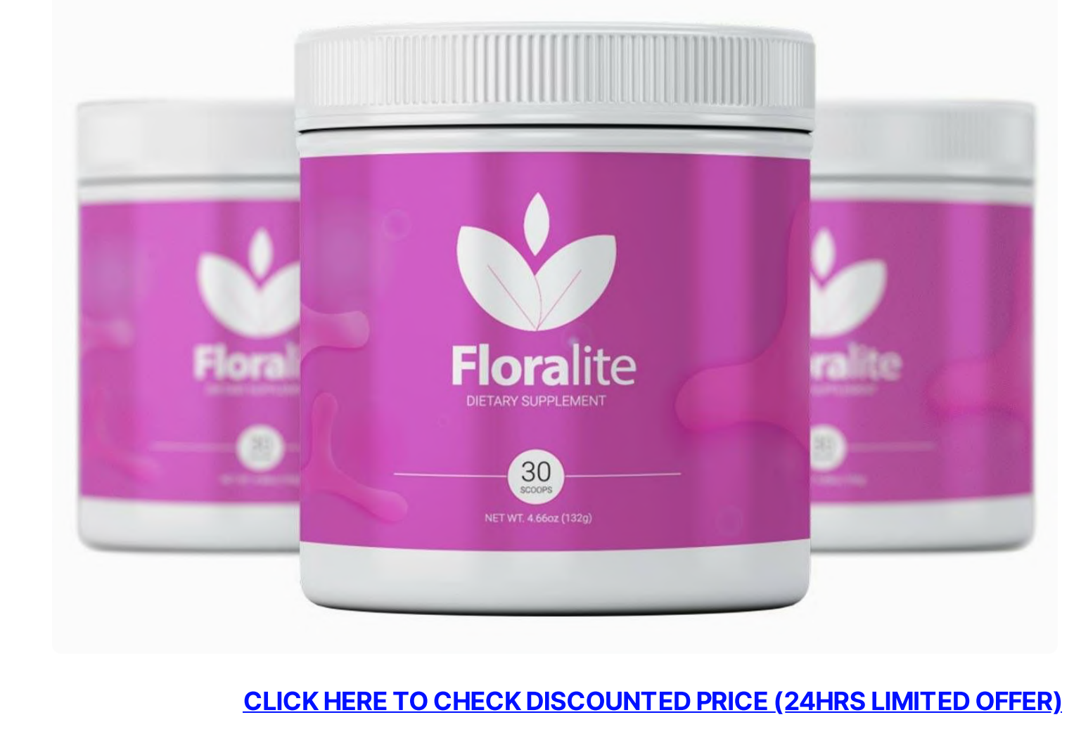
Floralite also contains 400 mg of power prebiotics, you can be assured these microbes survive harsh stomach acids and are fueled enough to destroy bad bacteria and regulate your gut environment.

According to Floralite Review, Floralite is a gut microbiome balancing formula that will help you lose weight fast. Floralite contains 2,5 billion colony forming units of pure, alive and active microbes designed to nourish your gut, making you lose fat incredibly fast.