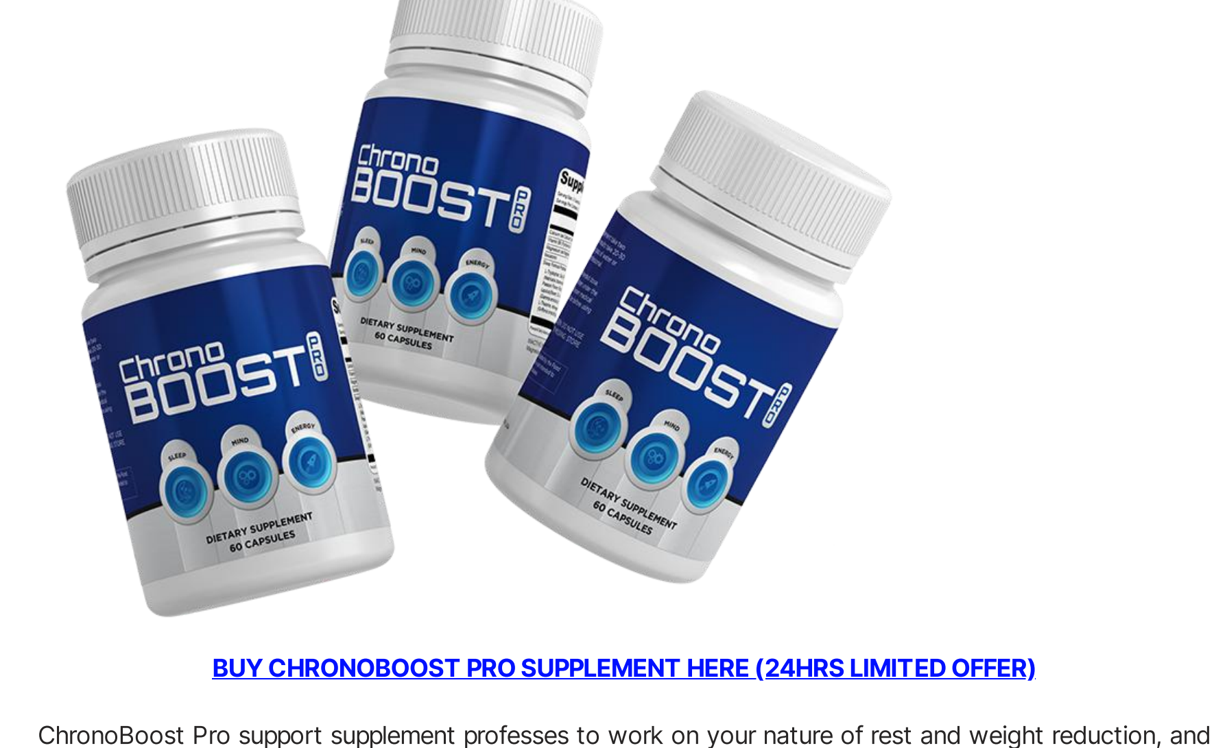
help with diabetes 2. It professes to give a reasonable psyche, further develop the center, and may likewise

the more enthusiastically. The enhancement is loaded with more than 18 interesting and strong spices that assist to detox your cerebrum and changing your intrinsic capacity to rest soundly to areas of strength for assembling normally.