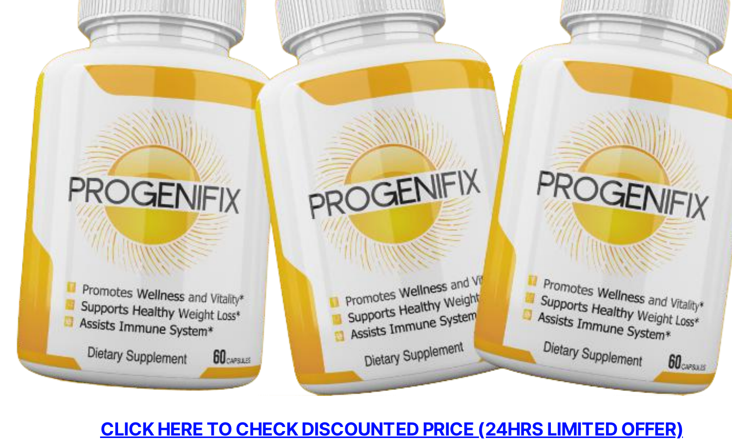
scientifically-proven metabolism-boosting chemicals. This pill targets the underlying reason of a sluggish

This dietary supplement is composed of the finest Amazonian rainforest-sourced components. This organic supplement helps to maintain a healthier, younger, and brighter skin texture. This expedites the process of reaching your optimal body composition.