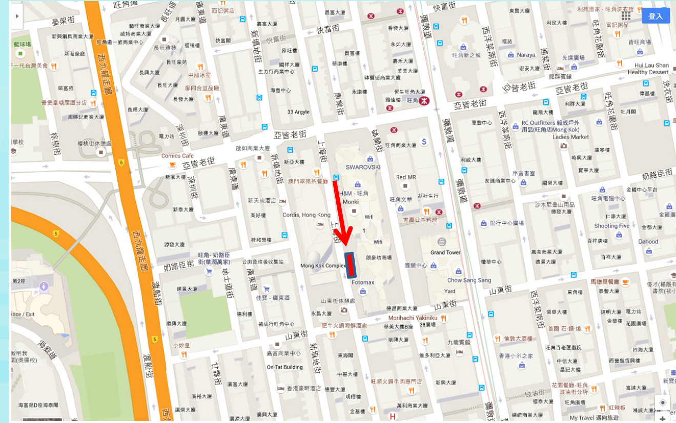
上海街朗豪坊 203E 巴士站