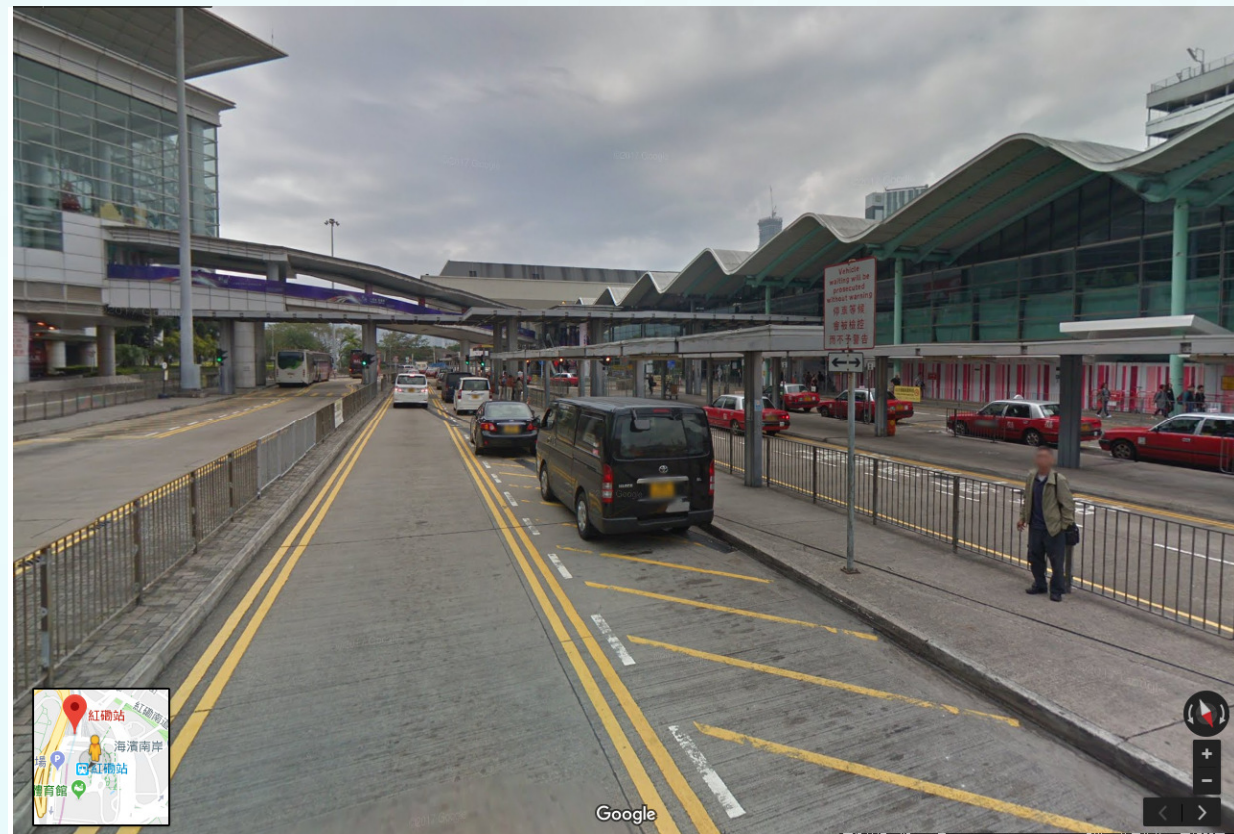
Map: 紅磡站 Hung Hom