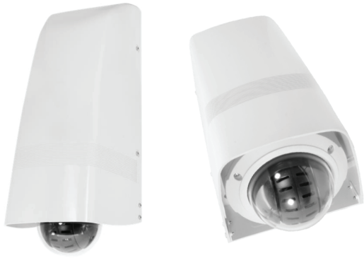
Figure 4. Insite Sentinel Optical Sensor from AAEON Technology.