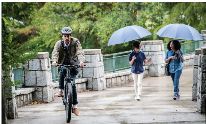
Figure 3. Encouraging active transportation helps support net-zero goals.

Assisted by visualizations such as charts, heatmaps, and tracking maps, insights based on current data can help local authorities make and justify informed, environmentally sound space planning choices such as changing a thoroughfare to a pedestrian area or adding lanes for non-motorized traffic. Changes such as these can contribute directly to helping local authorities meet their zero-carbon goals. They can also help improve public safety and health by encouraging active travel such as cycling or walking. Similar analyses could support planning for special events, such as reducing traffic by identifying the best way to route it around a market or festival.