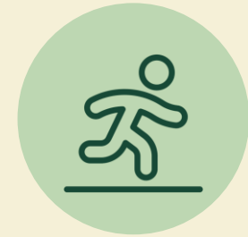
nib Diabetes Care