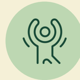
nib Healthy Lifestyle