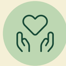
nib Cardiac Care