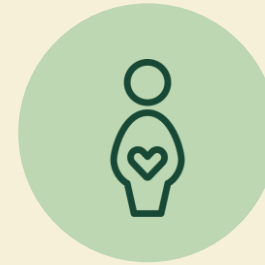
nib Women's Wellness