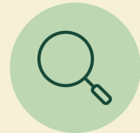
nib Bowel Screening