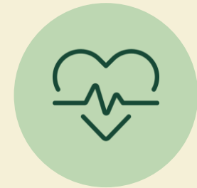
nib Healthier Heart