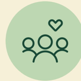
nib Cancer Care