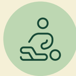
nib Healthier Joints: Pain Management