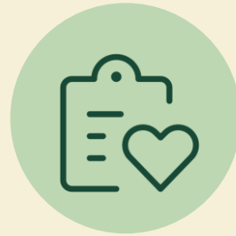
nib Wellness Coaching

Available at an employee level. Simple, easy and confidential. Contact nib and one of our wellness coaches can guide you.