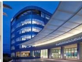
Phase 2 of Ocean View Tower at Sharp Chula Vista