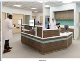
ED and ICU at Sharp Coronado