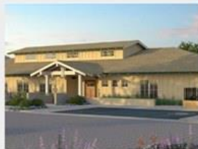
MountainView Hospice Home in Poway