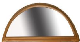
A) Half Circle Mirror