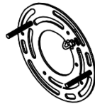
(B) Mounting Plate