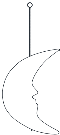
(A) Moon x1