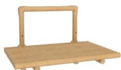
A) Shelf [18.1 x 6.5 x 9.1"] x1 or [46 x 16.5 x 23 cm]