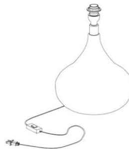
(B) Lamp Base x1