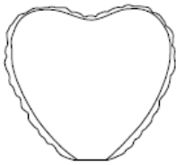
(A) Lamp Shade