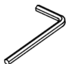
(E) Allen key