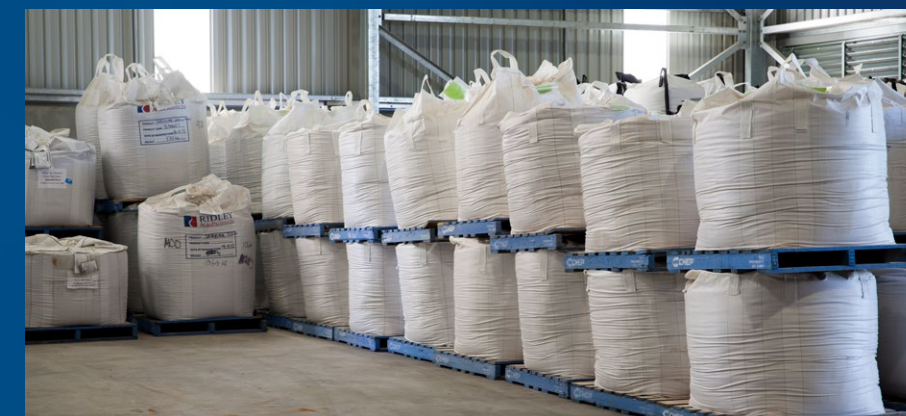
500kg & 1 Tonne Bulk Bags

We have the capability to customise feeds specifically for your horses.