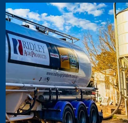
Truck to Silo Delivery

We have the capability to deliver bulk feed by truck direct to your silo, and in multiple pack types and sizes to suit your operation's needs.