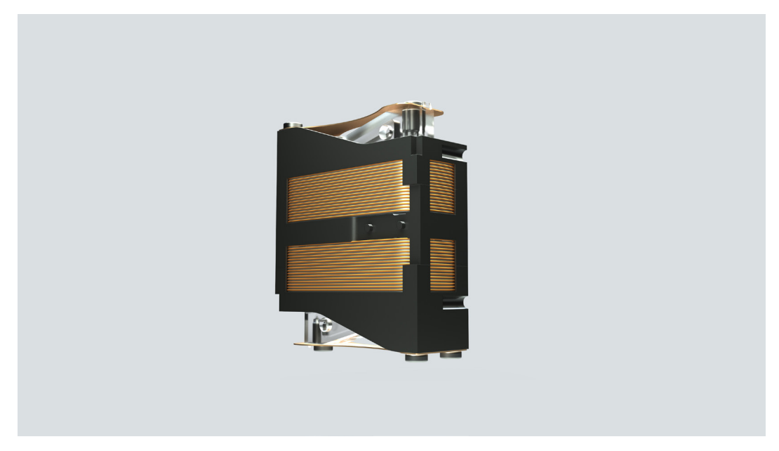
Wideband Lofelt L5 haptic driver included inside the Razer Nari Ultimate

Lofelt Wave enhances a game's soundscape, creating natural, lifelike effects that lets players feel every action-packed moment in their favorite games. Lofelt Wave features intelligent Digital Signal Processing (DSP), which detects the shape and frequencies of the game audio during gameplay and translates them into HD haptic signals. In addition, wideband Lofelt L5 haptic drivers integrated into the headset transform these signals into high-precision vibrations, bringing the game to life.