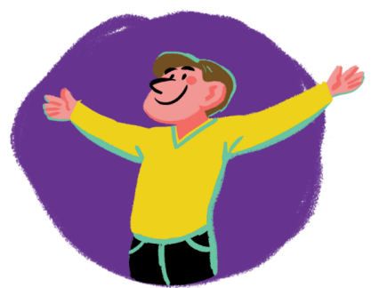
According to the Declaration of Independence, God CREATED ALL MEN TO BE FREE.