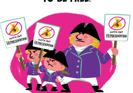
TAXATION WITHOUT REPRESENTATION

was a top grievance that the colonists had against Britain.