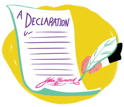
The signers of the Declaration knew they were putting their lives on the line and that they were committing ____ against the British Empire.