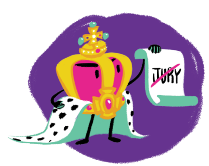
In addition to "taxation without representation," the Declaration stated that the British King deprived the colonists of the benefit