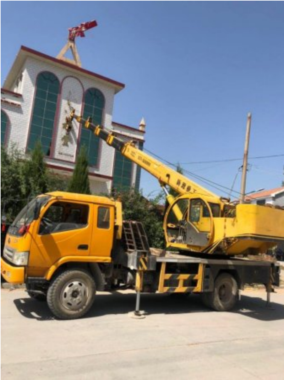
Photo: Authorities make changes to the exterior of a church in Zhengzhou city, Henan province.