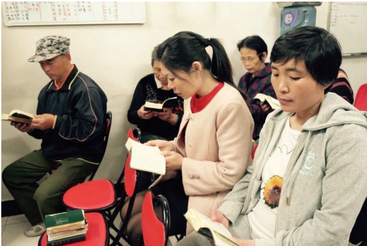
Photo: Millions of Chinese attend underground churches like this Protestant one in Beijing.

He said the only places where the Bible could be discussed freely were small church setups in houses, where 20-30 people could gather.