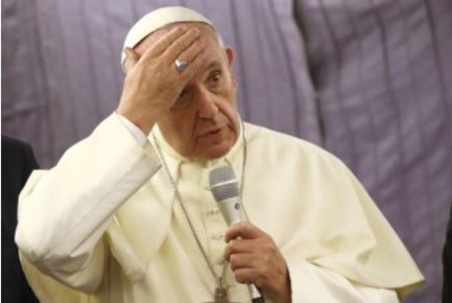
Photo: China has been appointing bishops without the Pope's consent. (AP: Alessandra Tarantino)

On Saturday, the Vatican signed an agreement giving it a long-desired and decisive say in the appointment of bishops in China, though critics labelled it a sell-out to the Chinese Government.