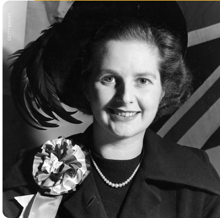
Margaret Thatcher on Women in Politics: