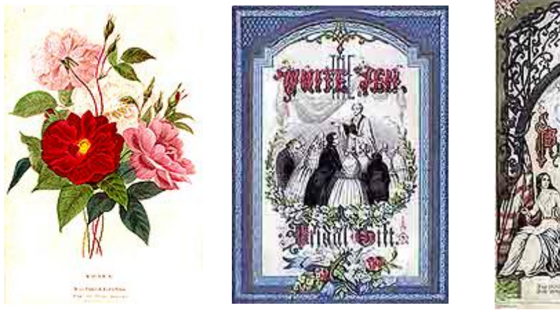
Flora's interpreter: or, the American book of flowers and sentiments. Boston: Marsh Capen & Lyon, 1833.

Sarah also continued her independent writing and editing career. Her publications ranged from Flora's Interpreter , containing images of flowers with uplifting American poems, to Woman's record; or sketches of all distinguished women from "the beginning" till A.D. 1850 (New York: Harper & Brothers, 1853). She also edited a number of best-selling poetic "gift books" with decorative title pages.