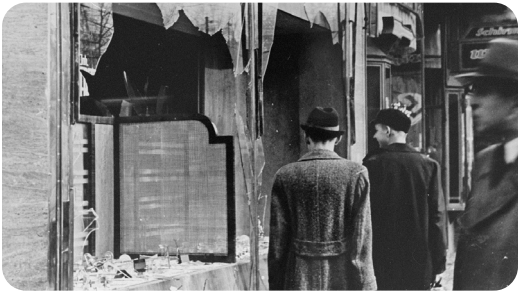
German citizens pass Jewish stores destroyed in Berlin during Kristallnacht, 1938.

In 1933, Adolf Hitler rose to power and promised to rid Germany of the Jews, whom he blamed for all of Germany's problems. Within a few years, half of German Jews were fired from their jobs. Jewish homes and businesses were looted and reassigned to non-Jews. Many Jews were arrested and imprisoned. Because so many Jews wanted to leave Europe, world leaders convened to address the growing problem.