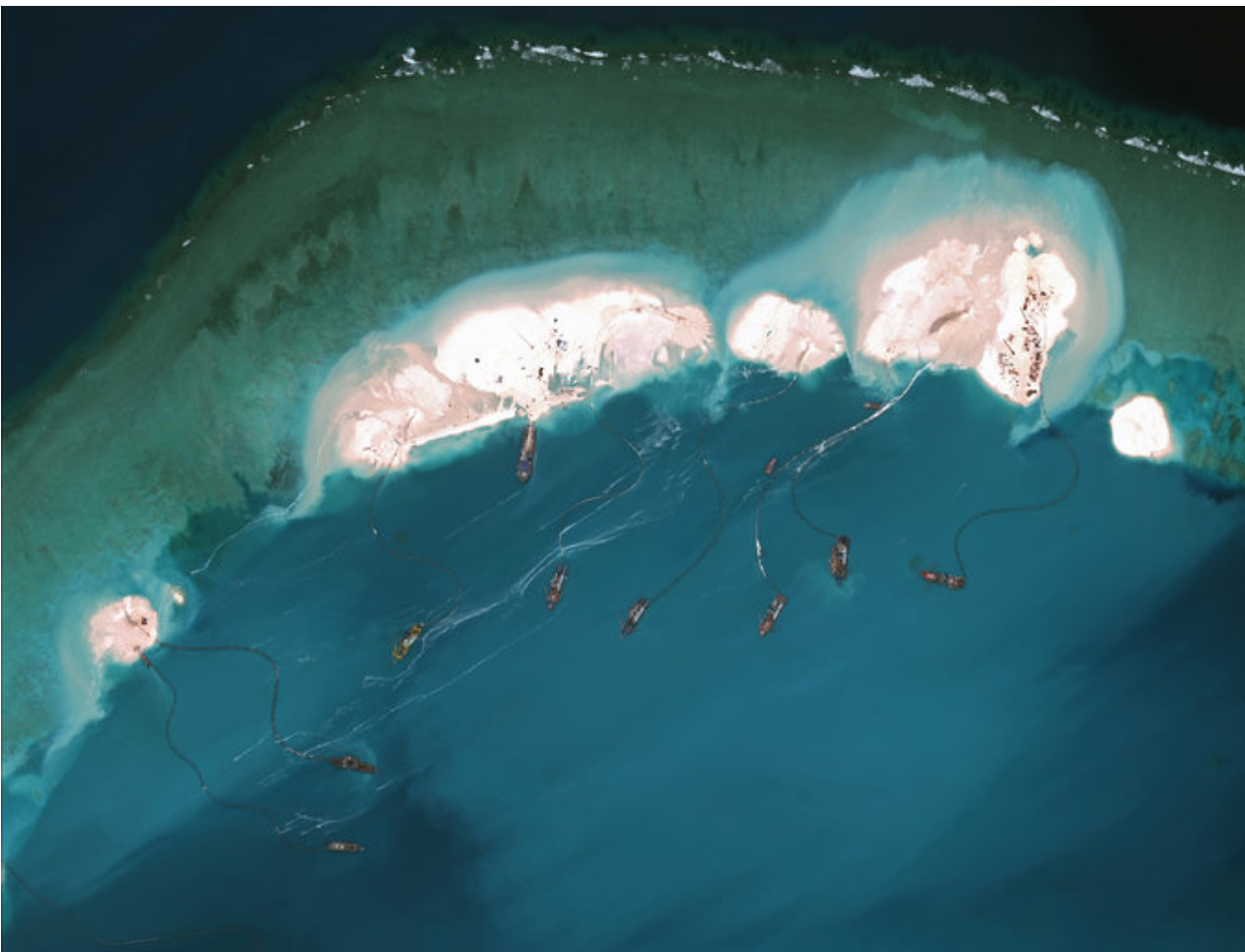
A satellite image from March showed work on an emerging artificial island at Mischief Reef, part of the Spratly Islands in the South China Sea. China has been turning submerged reefs into islands to bolster its territorial claims.