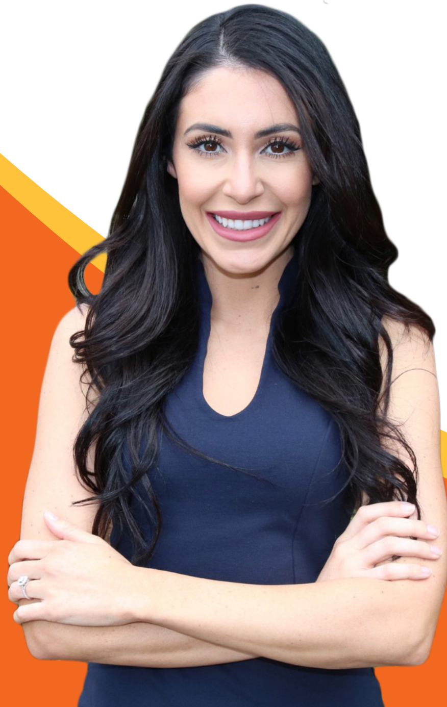
Conservative commentator Anna Paulina

WE ARE YOUNG, WE ARE LATINOS, AND WE ARE THE AMERICANOS!