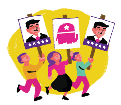
Citizens can volunteer to help during a political party's campaign at the local or community levels, which is also known as the GRASSROOTS LEVEL.