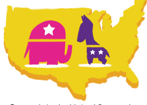
Currently in the United States, there are several political parties, but the two most competitive parties are DEMOCRATS AND REPUBLICANS.