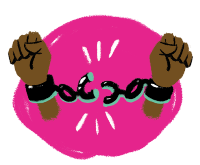
The REPUBLICAN PARTY was founded in 1854 as the party that opposed the expansion of slavery.