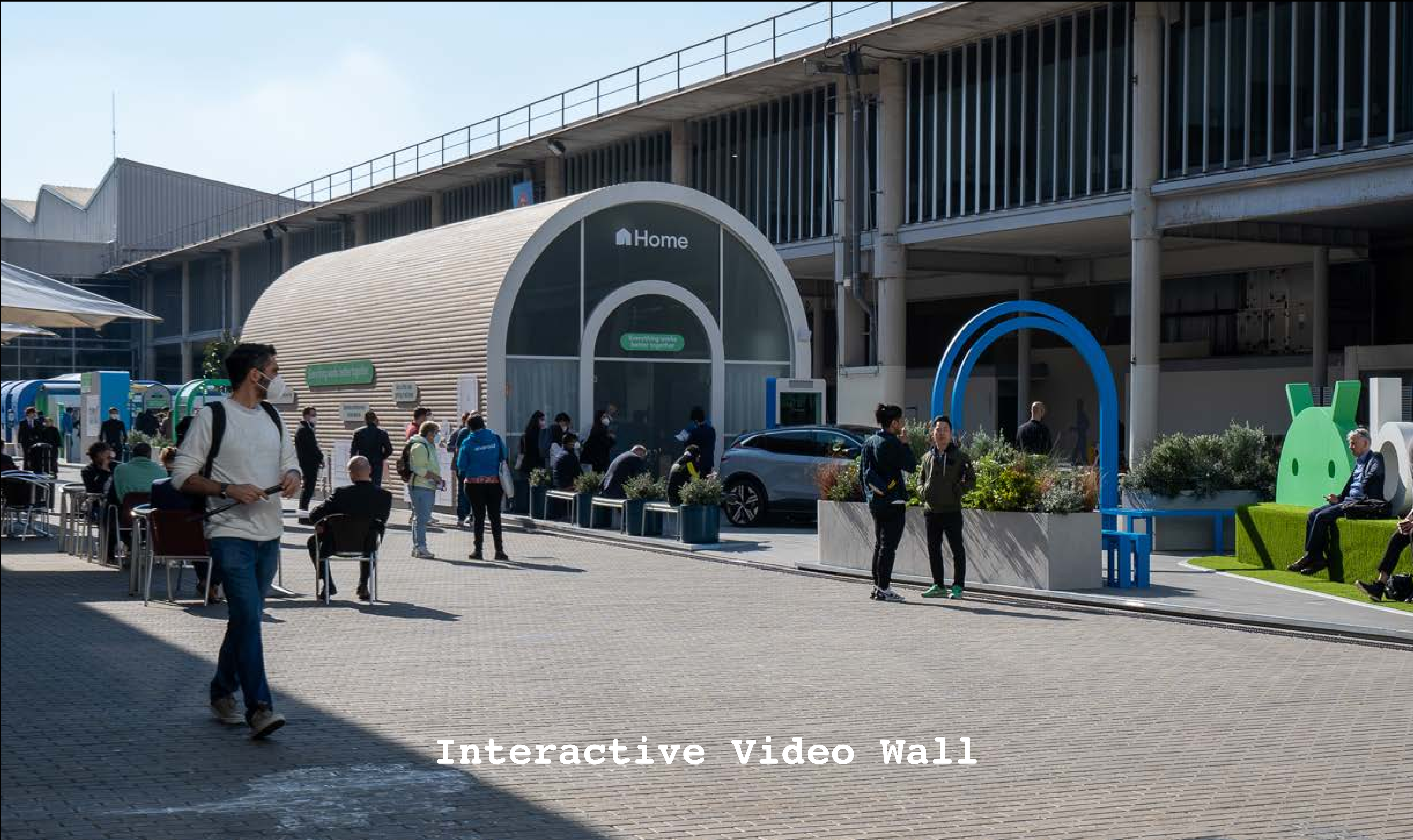
Interactive Video Wall