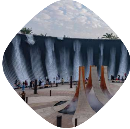
Surreal Water Feature