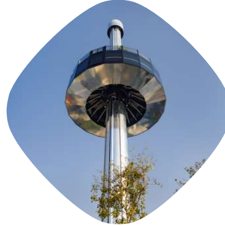
Garden in the Sky