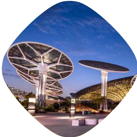
Terra – The Sustainability Pavilion