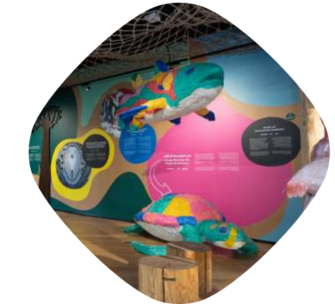
Stories of Nations