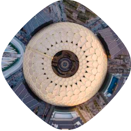
Al Wasl Plaza