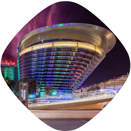
Alif – The Mobility Pavilion