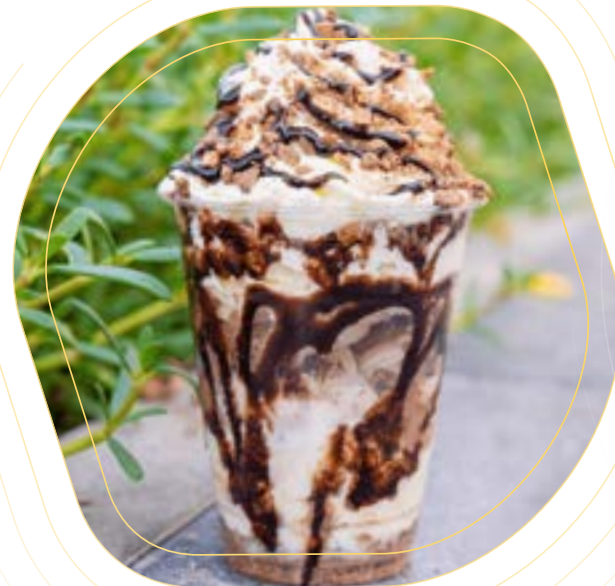
Kiosk Milky Ice