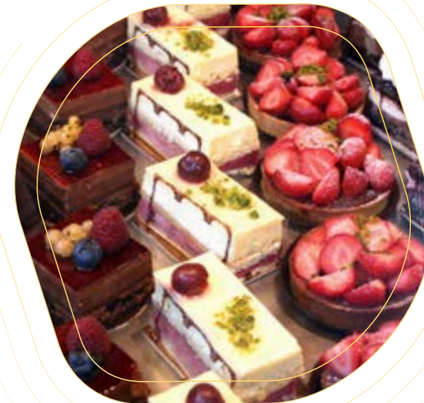
Kiosk Shoebox Bakery