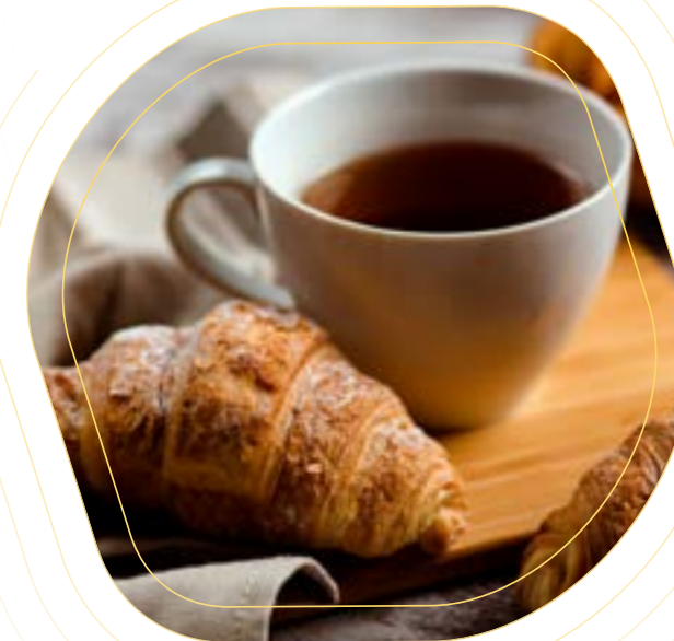
Kiosk Alif Café