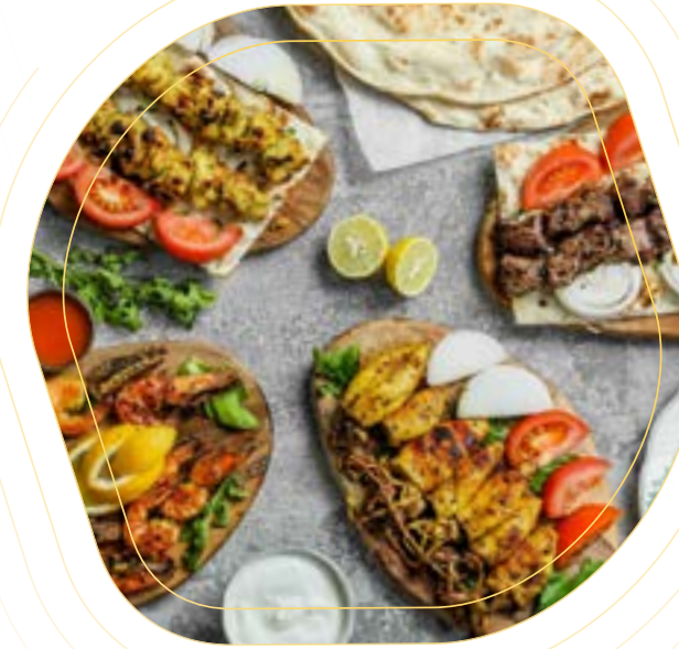
Restaurant Al Fanar