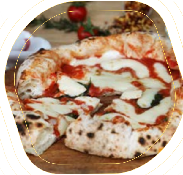
Restaurant ECCO Pizza & Pasta