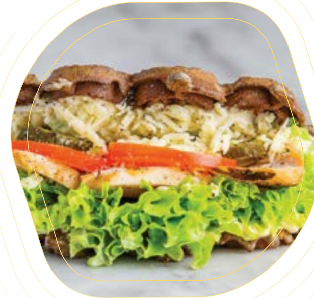
Food truck WOFL