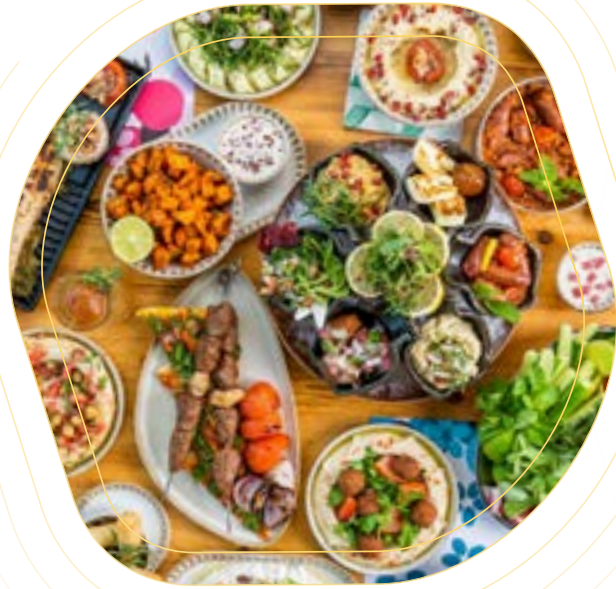
Restaurant Grand Beirut