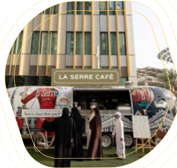
Food Truck La Serre