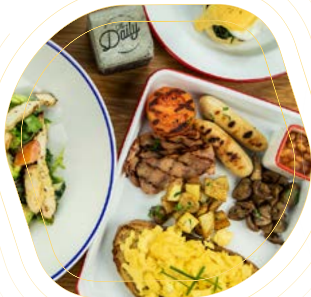
Restaurant The Daily at Rove Hotel