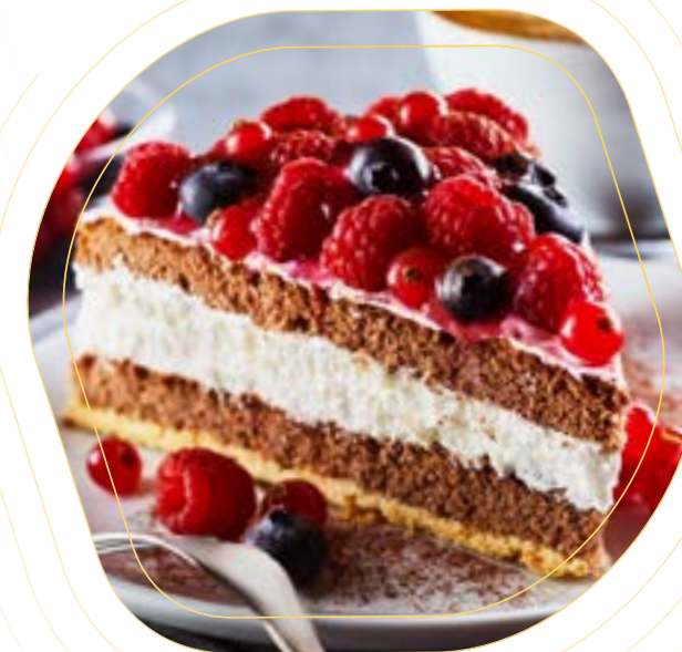
Restaurant PXB Café - Plant-based lifestyle hub in Terra