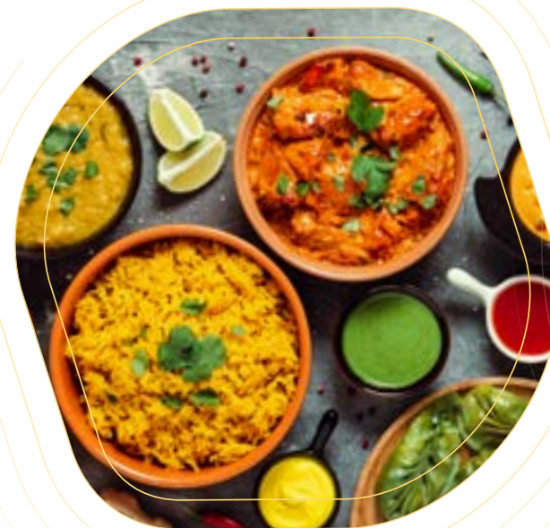
Restaurant Gupshup by Rohit Ghai