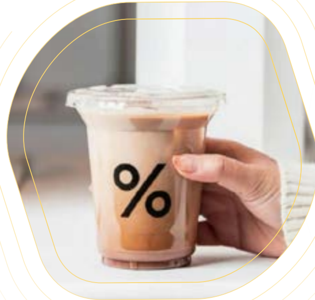
Food Truck Arabica

Food Truck & Kiosk | Opens from 12:00 to 20:00