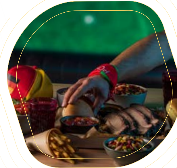
Food Truck Mattar Farm