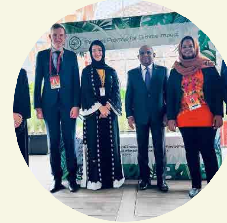
HE Reem Al Hashimy, UAE Minister of State for International Cooperation and Director General of Expo 2020 Dubai, and HE Abdulla Shahid, President of the UN General Assembly, with youth advocates at Climate Week