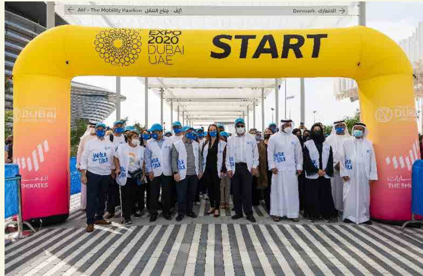
Universal Health Coverage Day #WalktheTalk - HE Reem Al Hashimy, UAE Minister of State for International Cooperation and Director General of Expo 2020 Dubai, and Dr Tedros Adhanom Ghebreyesus, Director General of WHO, join their teams and frontline heroes