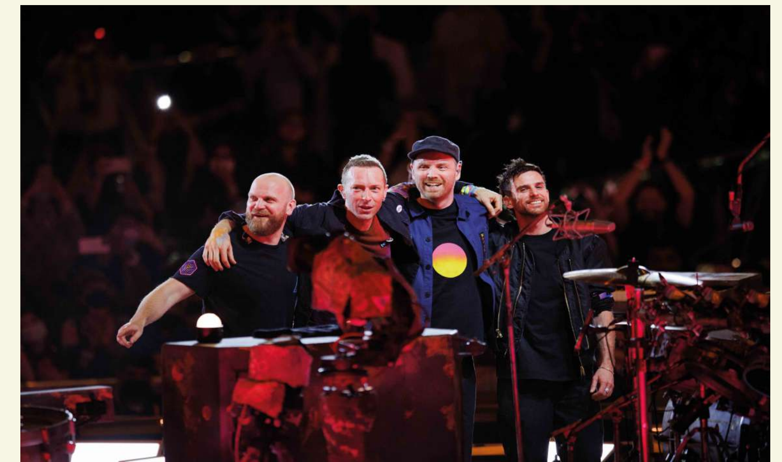
Coldplay perform live at Al Wasl