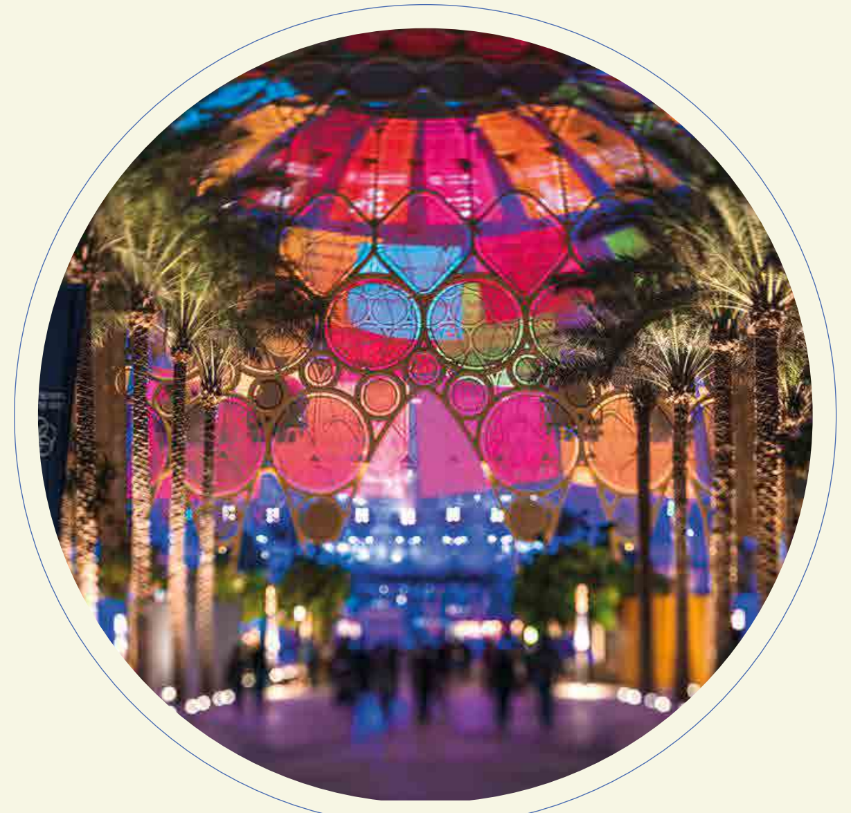
Al Wasl lights up during Global Goals Week