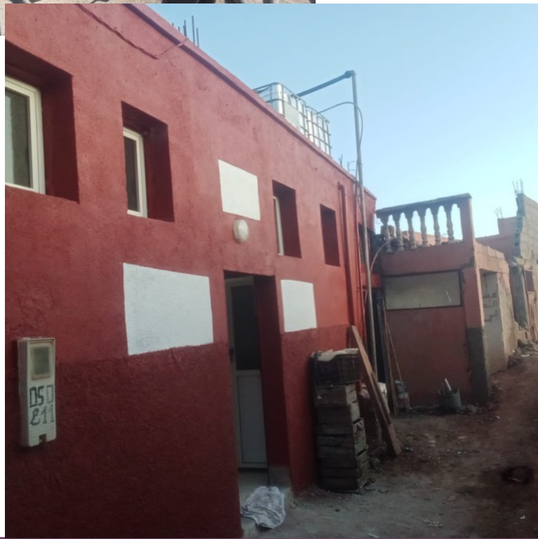
Rebuilding Tifaouine public hammam