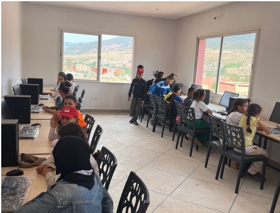
Tousna Study Centre opens in Asni