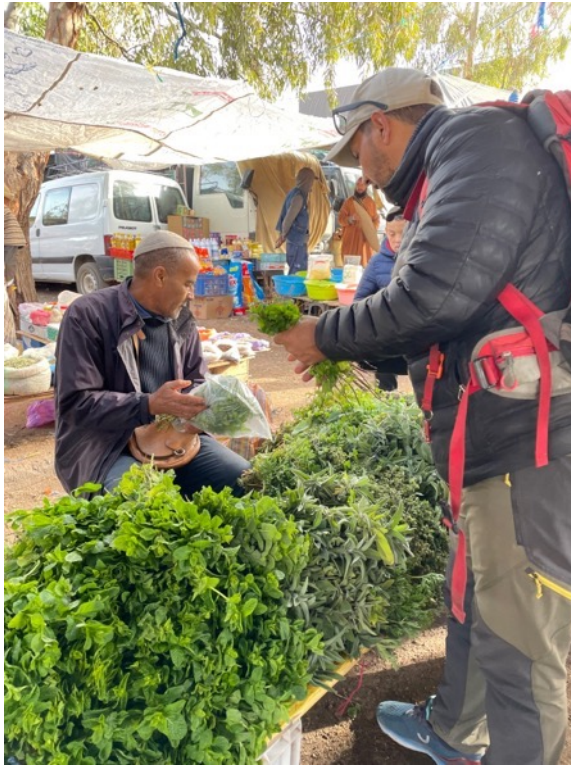
Asni market and a return to daily life.