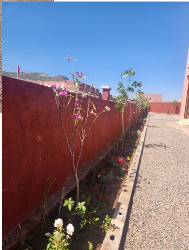
Tousna Study Centre Exterior