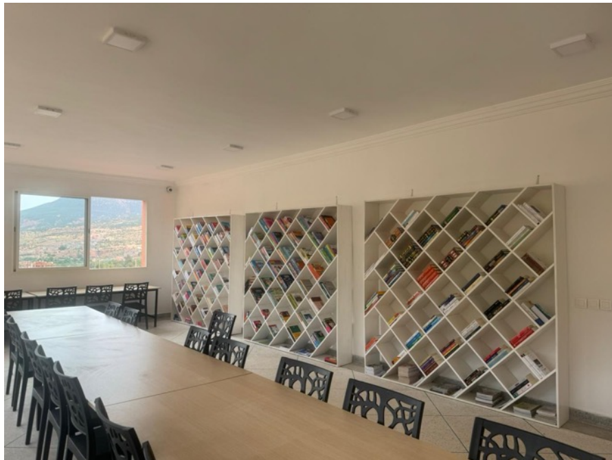
Tousna Study Centre Reference Library & Technology Room