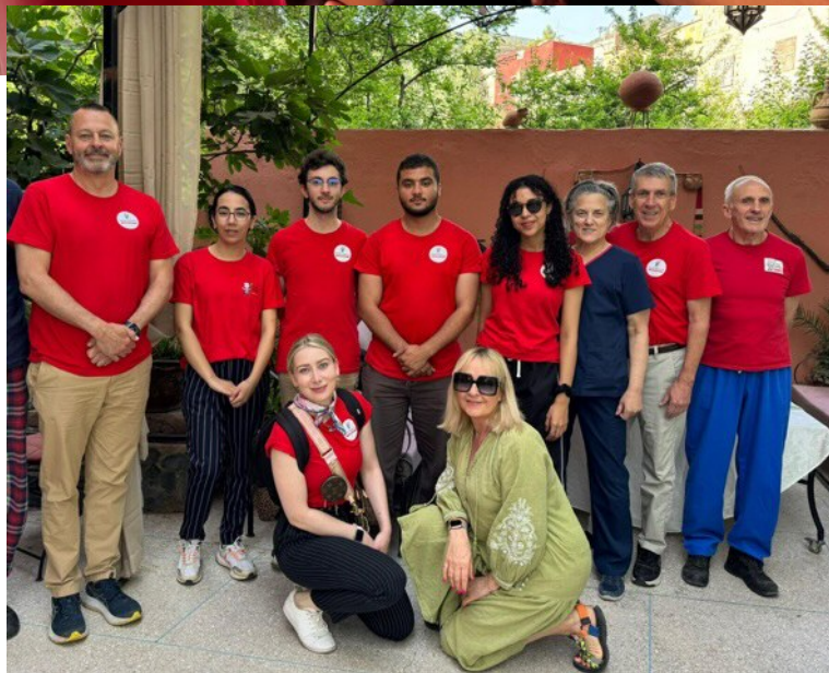
Asni Temporary Dental Clinic with The Dental Mavericks