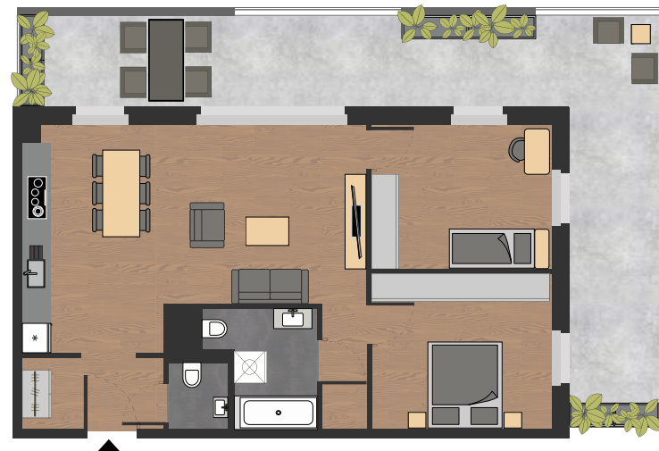
TOP 151, 13 th floor 3 rooms 76 m 2 living space with 44 m 2 balcony