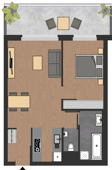
TOP 109, 9 th floor 2 rooms 55 m 2 living space with 15 m 2 balcony