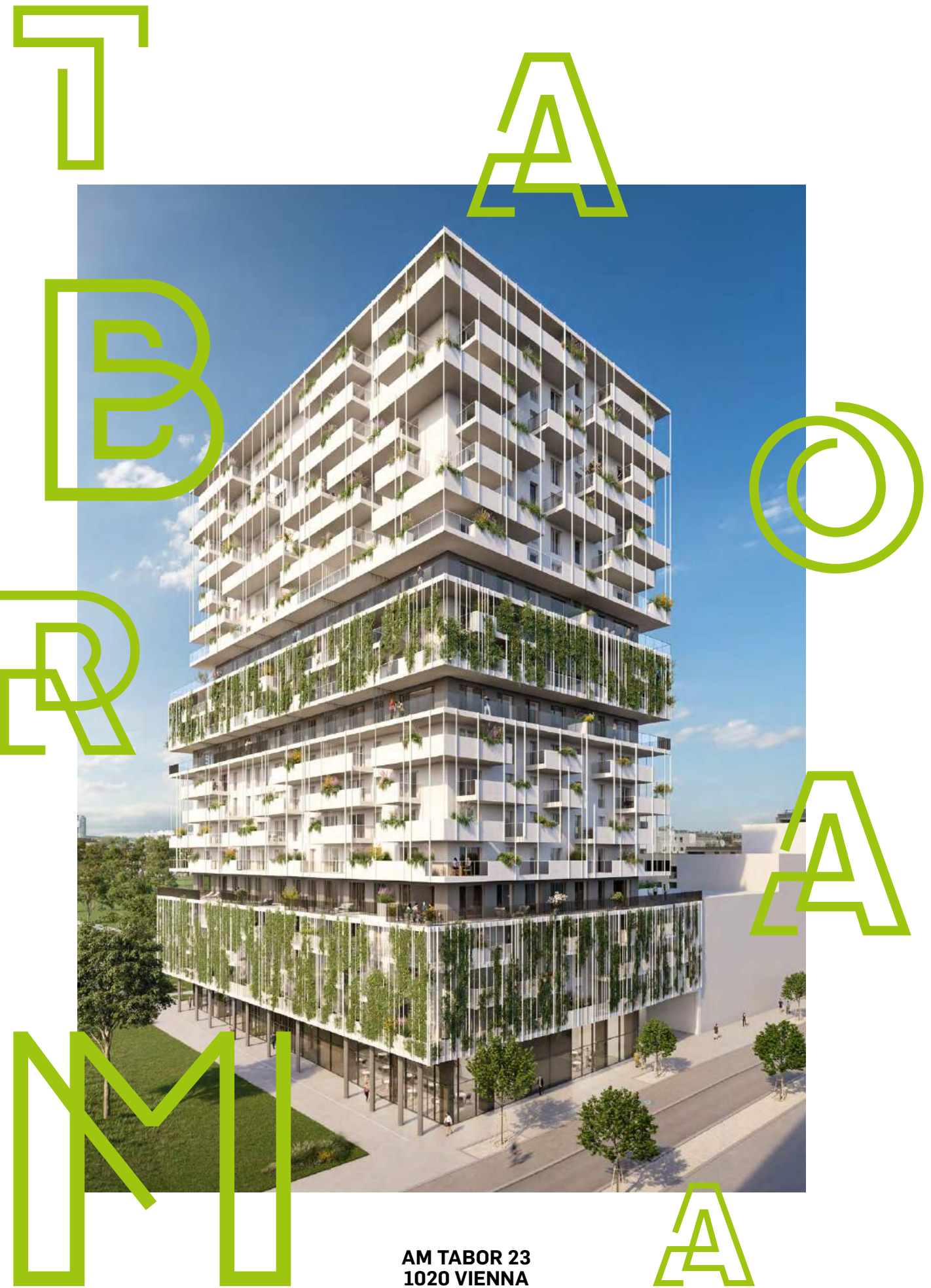
AM TABOR 23 1020 VIENNA