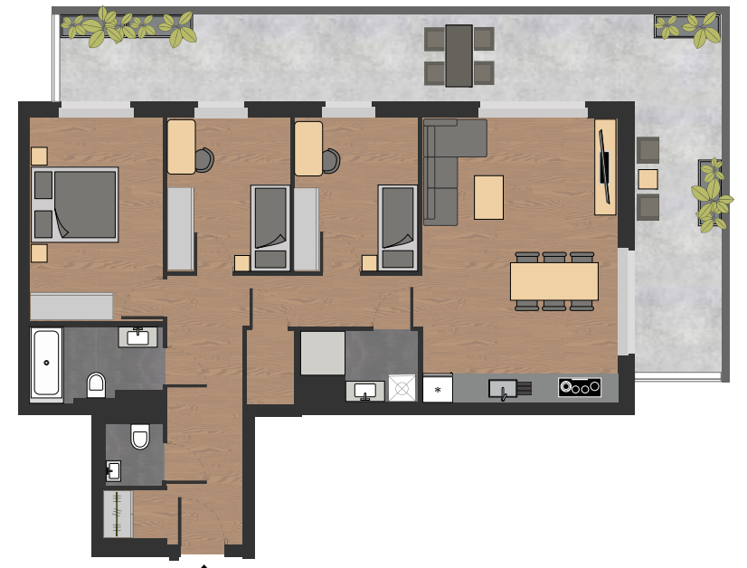
TOP 206, 19 th floor 4 rooms 97 m 2 living space with 45 m 2 balcony