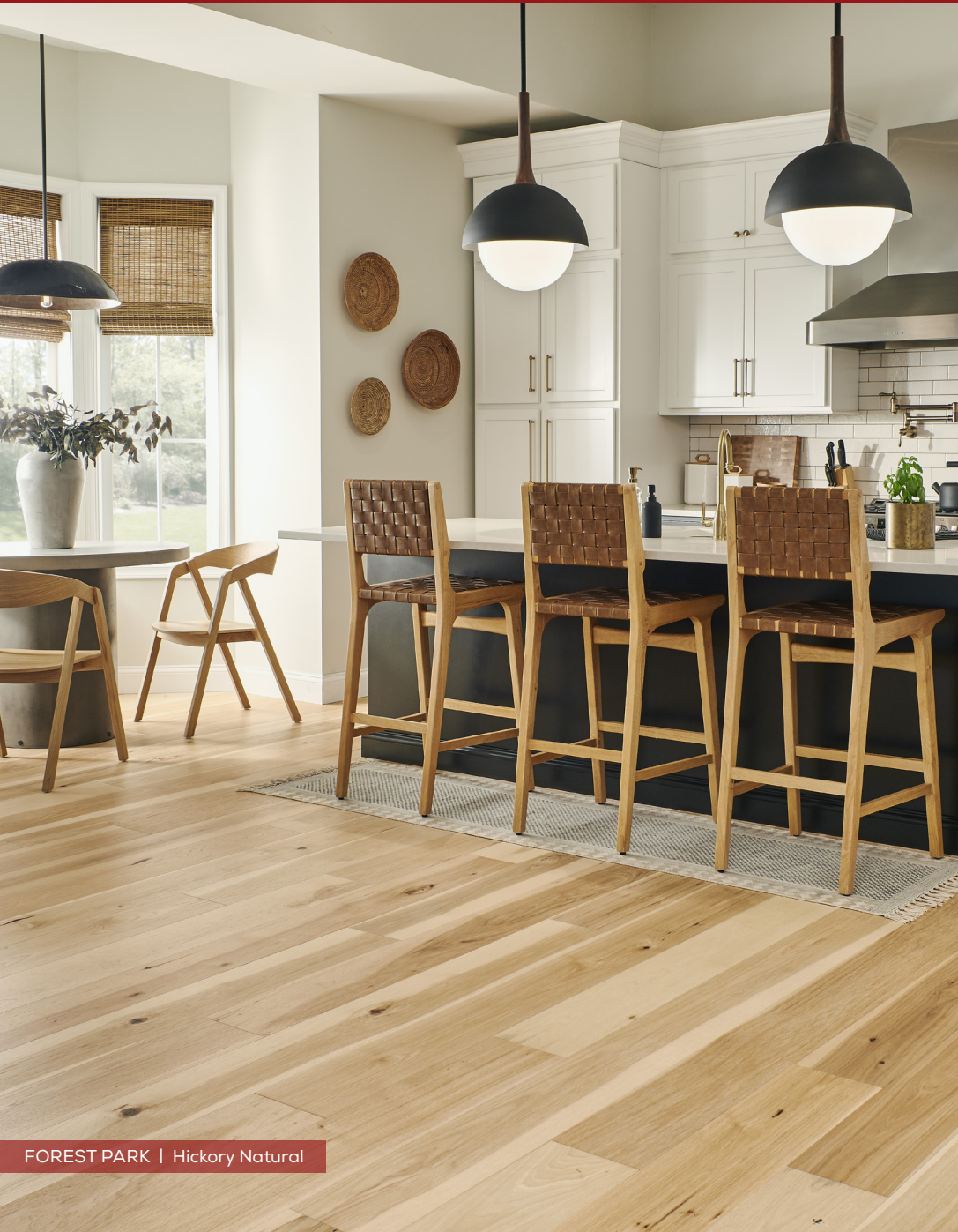
FOREST PARK | Hickory Natural

We are continuing to focus on elevating our line with on trend visuals consumers are looking for, like long and wide planks and premium sliced face veneers. Stunning visuals at meaningful price points.