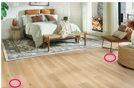
Shown: Haven with Digital Print featuring 20 Unique Planks