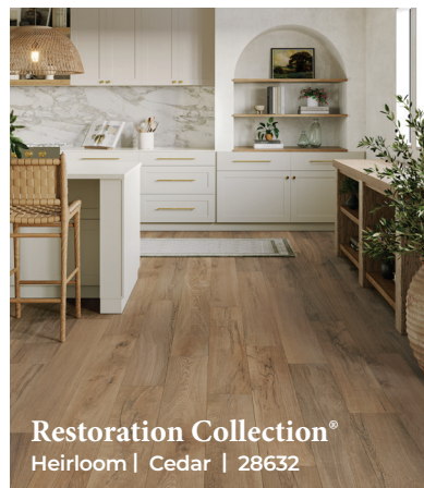
Restoration Collection® Heirloom | Cedar | 28632

Heirlooms represent family history and treasured memories. They are timeworn and preserved for generations to come. This year we are introducing Heirloom to the award-winning Restoration Collection®. This European White Oak pattern features the authenticity and refined rustic qualities reminiscent of a reclaimed antique. Heirloom features a deep wire brushed texture combined with a patina of natural cracks and knotholes. The warm color palette makes this pattern a great compliment to any