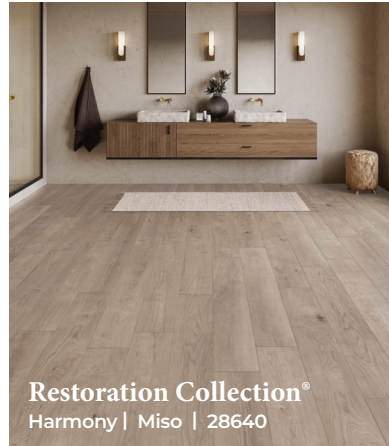
Restoration Collection® Harmony | Miso | 28640

Harmony can be found everywhere in Japan whether it's the clean lines and understated nature of the architecture or the orderly way in which they organize the home. The concept of harmony is at the heart of Japanese culture. The new Japanese Maple Restoration Collection® pattern called Harmony will create a peaceful and harmonious environment in which to live and work within the home. Maple with its smooth surface and consistent graining make for a clean timeless look that coordinates perfectly