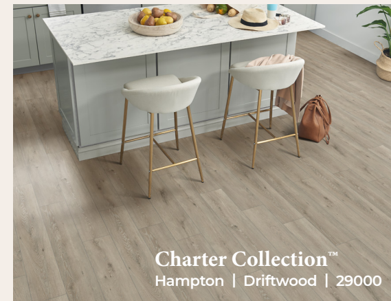
Charter Collection™ Hampton | Driftwood | 29000