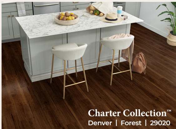
Charter Collection™ Denver | Forest | 29020

Charter Collection™ is warranted not to be damaged by topical, localized surface spills provided they are removed promptly. The Charter Collection™ Water Resistance Warranty is 10 years from the time of purchase.