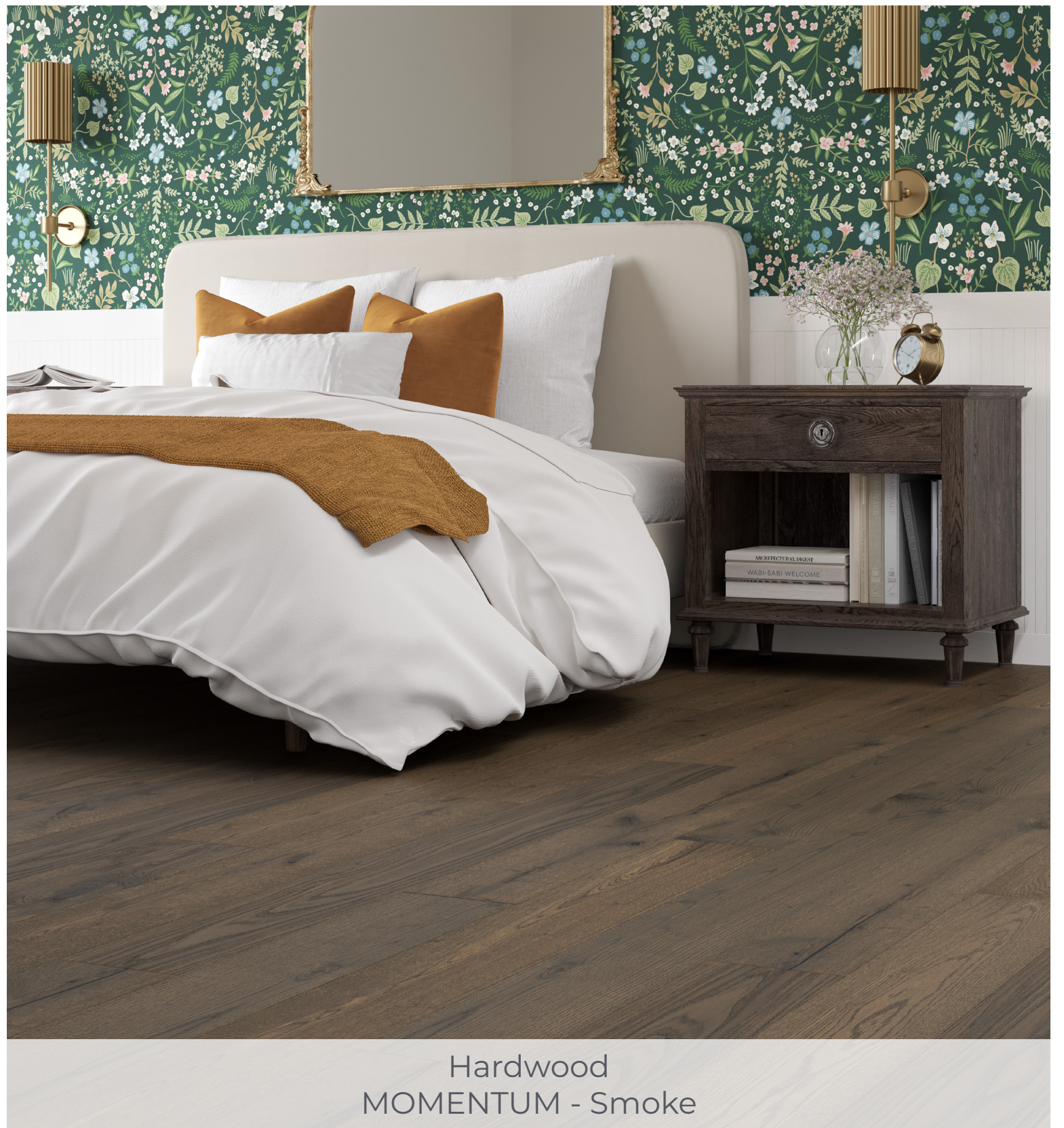
Hardwood MOMENTUM - Smoke