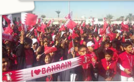
National Day Programme