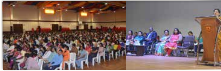
Orientation Programme for New Parents