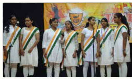
Talent Fest - Group Singing