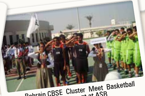
Bahrain CBSE Cluster Meet Basketball Tournament at ASB