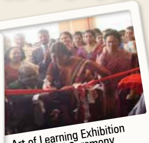
Art of Learning Exhibition Inaugural Ceremony