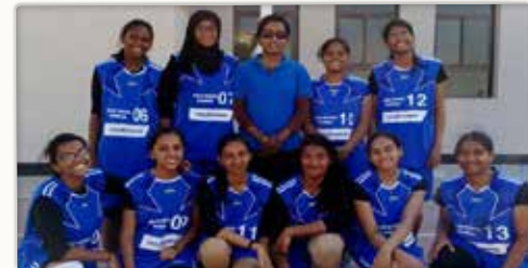
Bahrain CBSE Cluster Basketball Runners-Up (Girls Team)