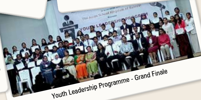
Youth Leadership Programme - Grand Finale