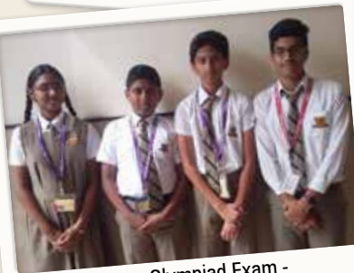
Green Olympiad Exam - Certificate of Distinction