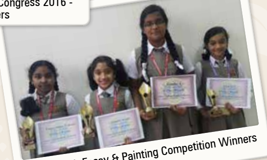
Lions Club Essay & Painting Competition Winners