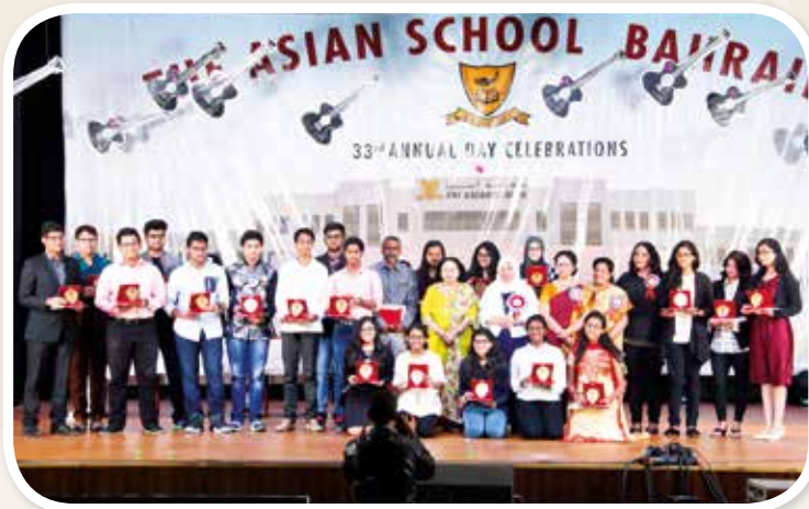
2015-16 Grade 10 Board Exam Toppers awarded