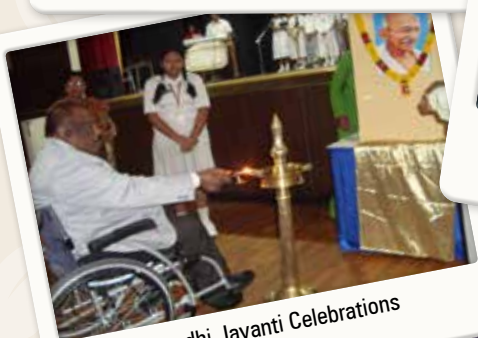
Gandhi Jayanti Celebrations