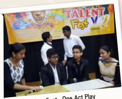
Talent Fest - One Act Play