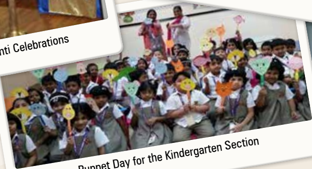
Puppet Day for the Kindergarten Section