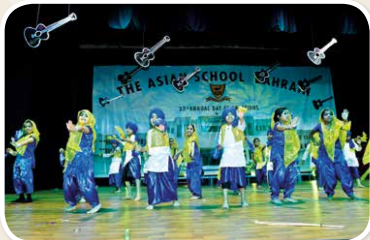
'Oye Balle Balle'