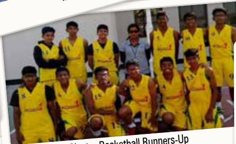
Bahrain CBSE Cluster Basketball Runners-Up (Boys Team)