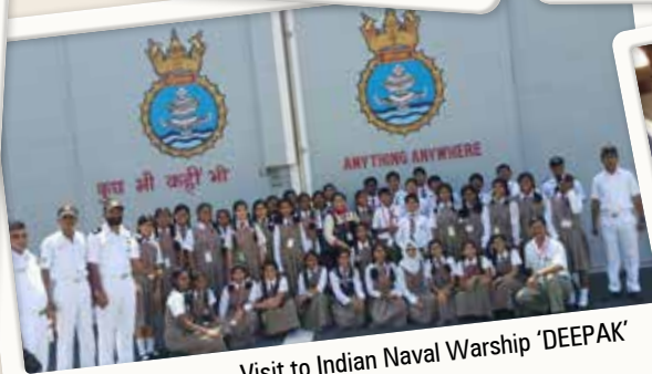
Visit to Indian Naval Warship 'DEEPAK'