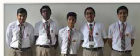
Bahrain Students Innovation Congress 2016 - 3rd Prize Winners