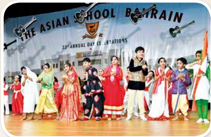
'Bahrain, Land of Peace'