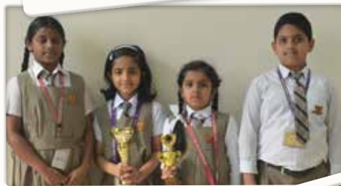
Lions Club Tiny Tots Clay Modelling & Colouring Competition Winners