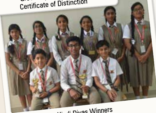
Hindi Divas Winners