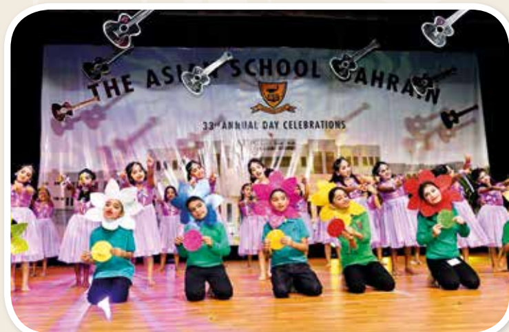
'I Can Fly'