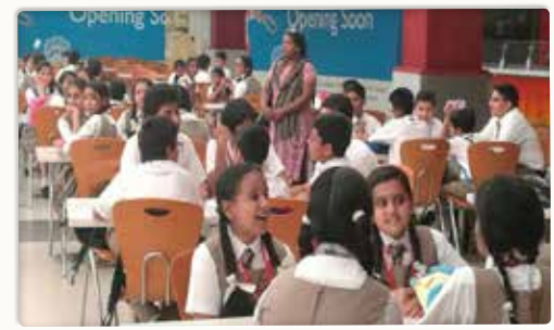
Visit to Planetarium - Students at Ramli Mall