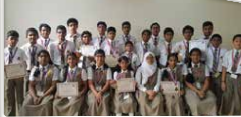
Sastra Pratibha 2016 A+ Graders