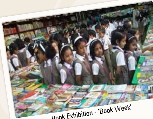
Book Exhibition - 'Book Week'