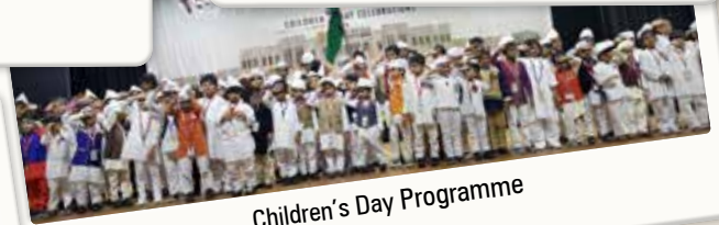
Children's Day Programme