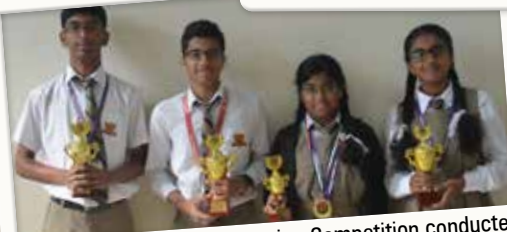
Winners of Speech and Drawing Competition conducted by Mahatma Gandhi Cultural Forum on Gandhi Jayanti