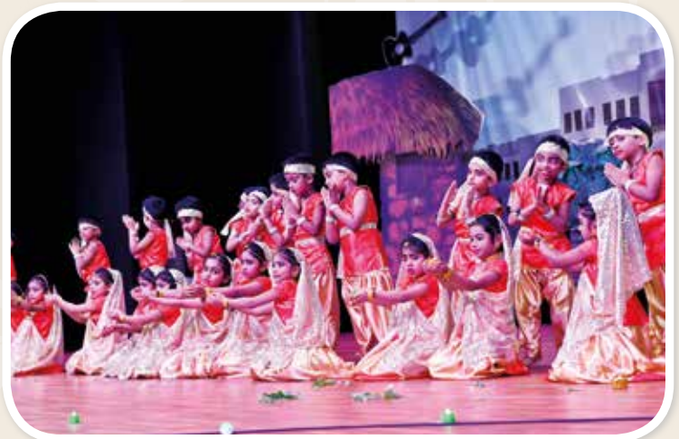
'Every Drop Counts'