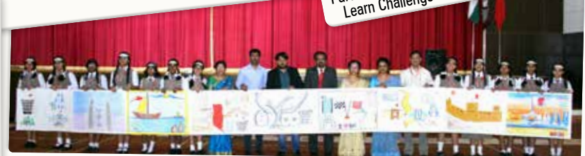
Fine Fair Art Carnival - Big Canvas Programme