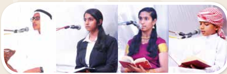
Recital of Holy Verses