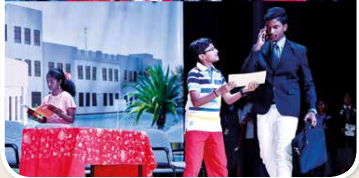
'To Be A Smart Phone'