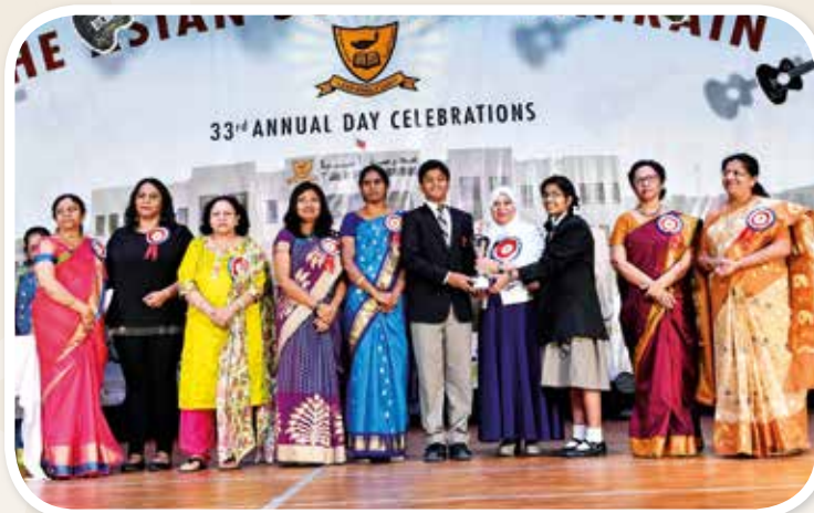
Ruby House receiving the Discipline Trophy for the year 2015-16