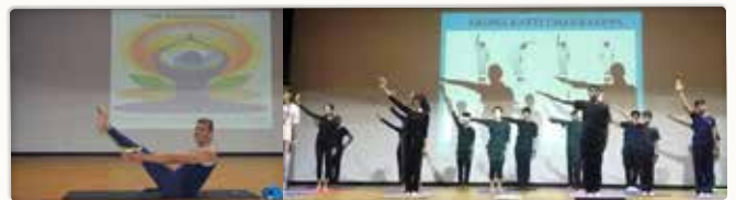
International Yoga Day - Iyengar Yoga Guru Eshan Ashgar