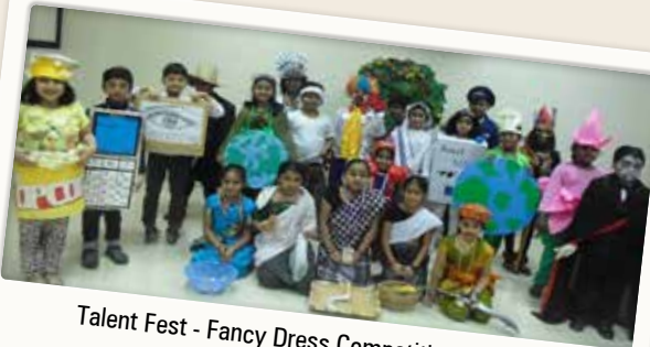
Talent Fest - Fancy Dress Competition - Juniors