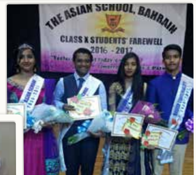
Grade 10 Farewell Celebrations - Winners of Personality Contest.