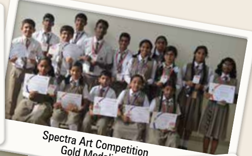
Spectra Art Competition Gold Medalists