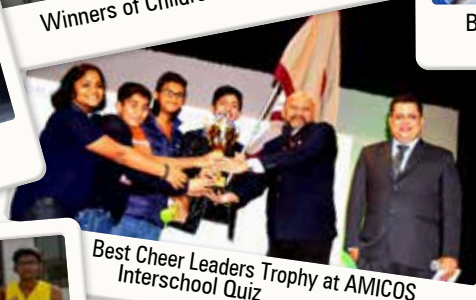
Best Cheer Leaders Trophy at AMICOS Interschool Quiz