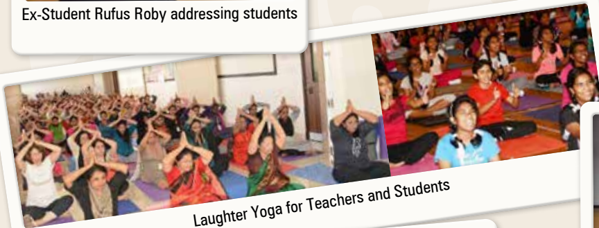
Laughter Yoga for Teachers and Students