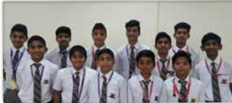
Winners of Cluster Competition - Track & Field Events (Boys)