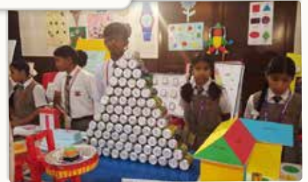
Art of Learning Exhibition