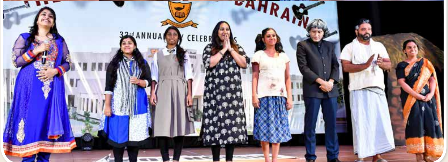
Our ex-students enthral us with their 'Vision 2020'