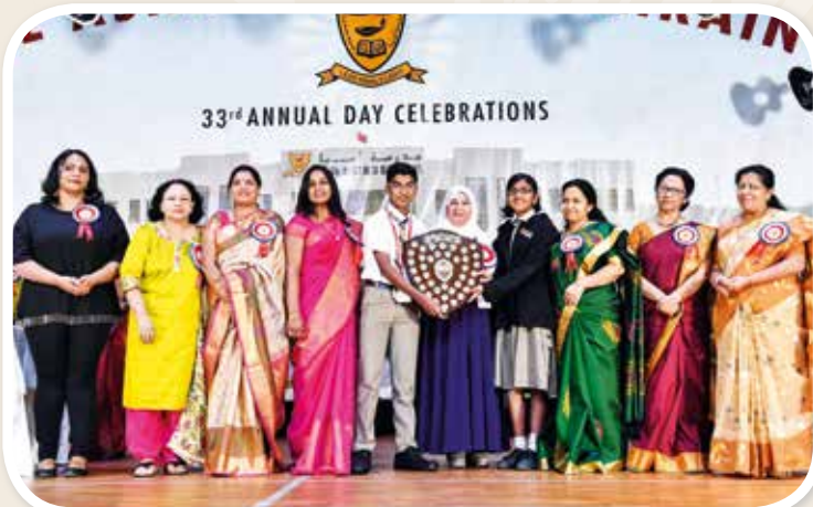
Sapphire House receiving the Sports Championship Shield for the year 2016-17