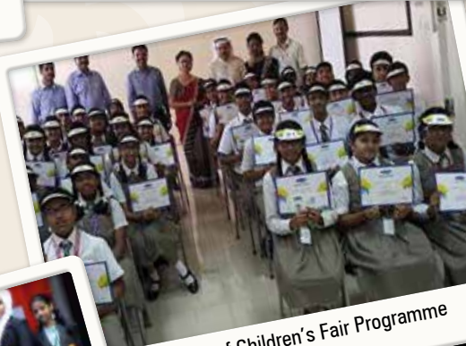
Winners of Children's Fair Programme