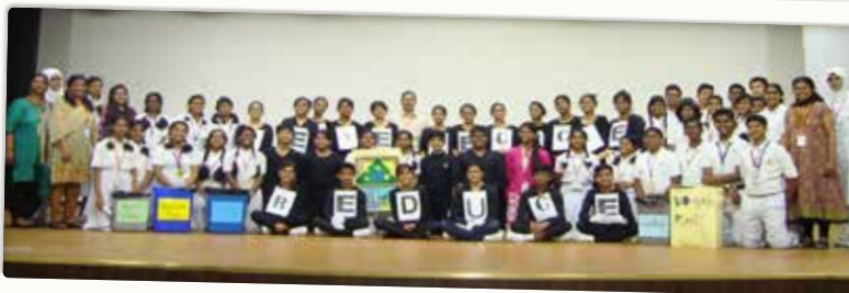
Waste Management Campaign