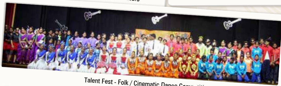
Talent Fest - Folk / Cinematic Dance Competition