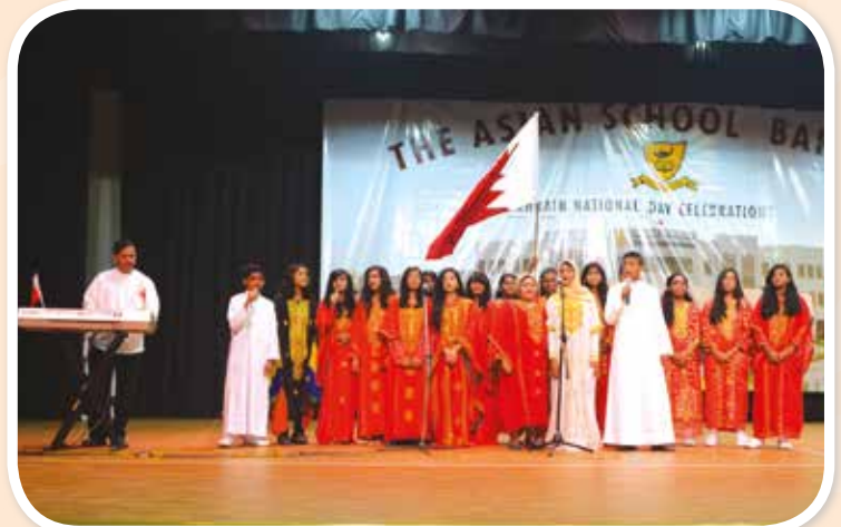
National Day Celebrations