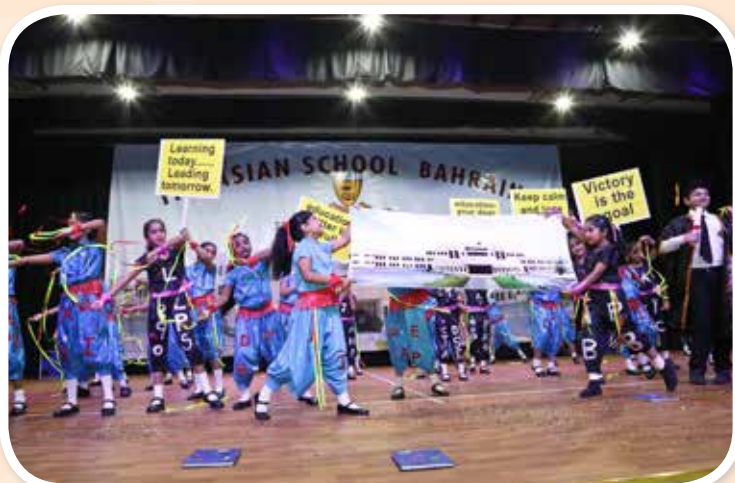
Education – 'Each One Teach One'