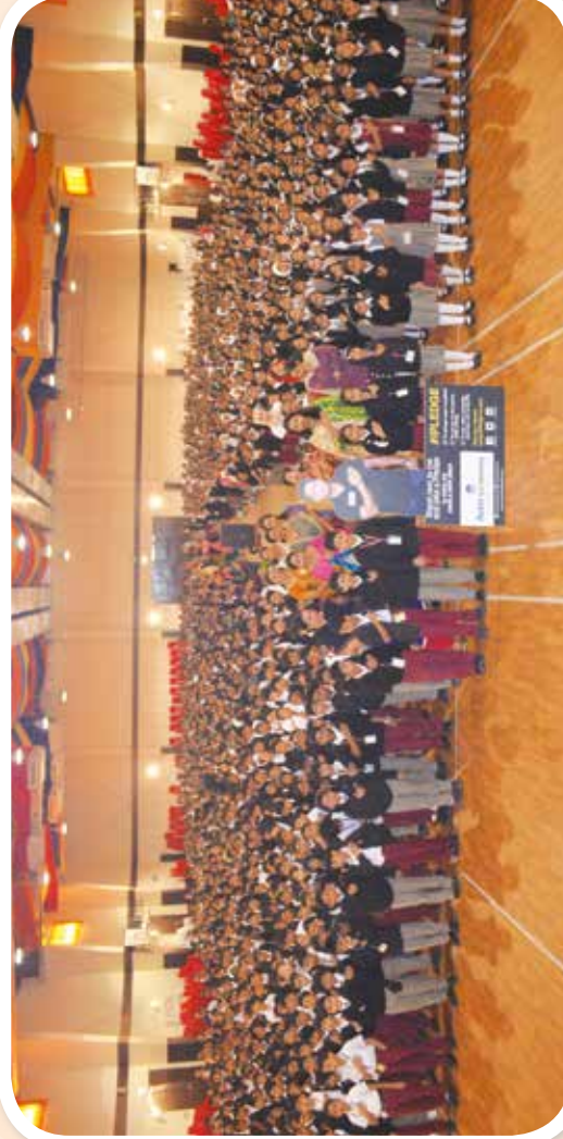
Road Safety Awareness Camp by Aster Medical Center and The Traffic Directorate Students taking a pledge to abide by traffic rules