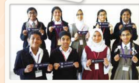
Outstanding Toastmasters of the School