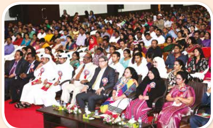
An enthralled audience enjoying the show