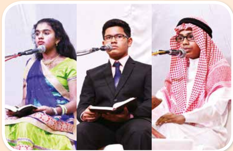
Reading of the Scriptures