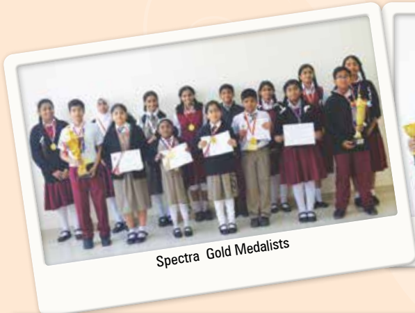
Spectra Gold Medalists