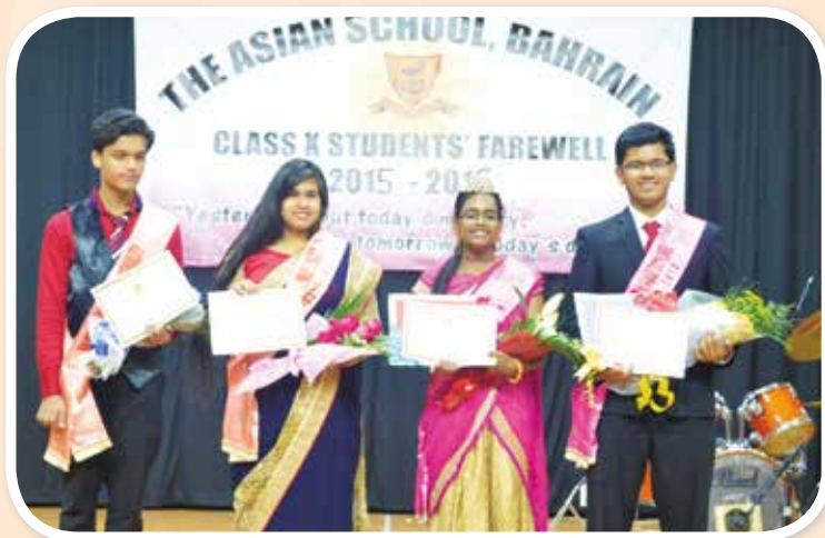
Winners of the 'Personality Contest'