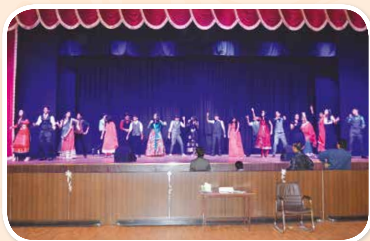
Farewell for Standard X hosted by Standard IX