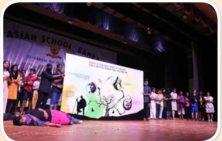
'Tell Me Why' - English Skit