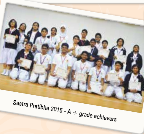
Sastra Pratibha 2015 - A + grade achievers