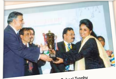
Receiving Spectra School Trophy