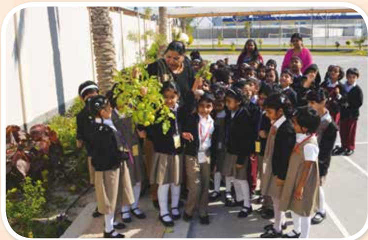
Hands on exposure to nature - Children excited to see the School vegetable garden