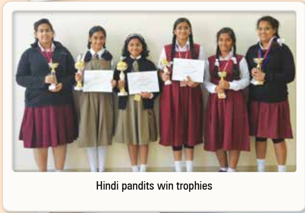
Hindi pandits win trophies