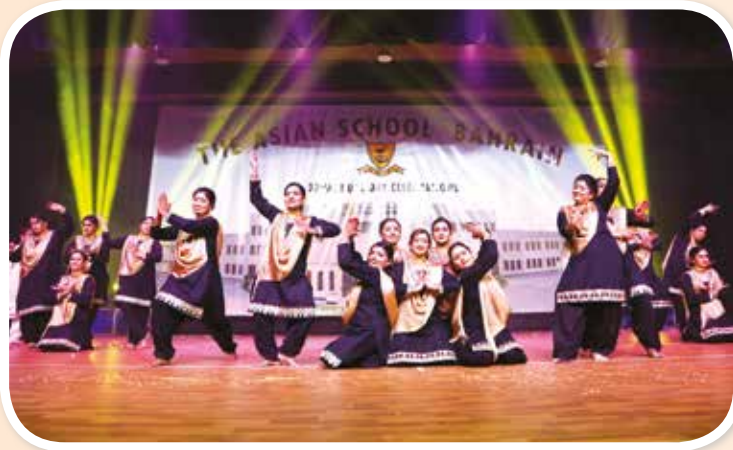
'Ekta Ka Anokha Raag', a scintillating performance by our talented teachers