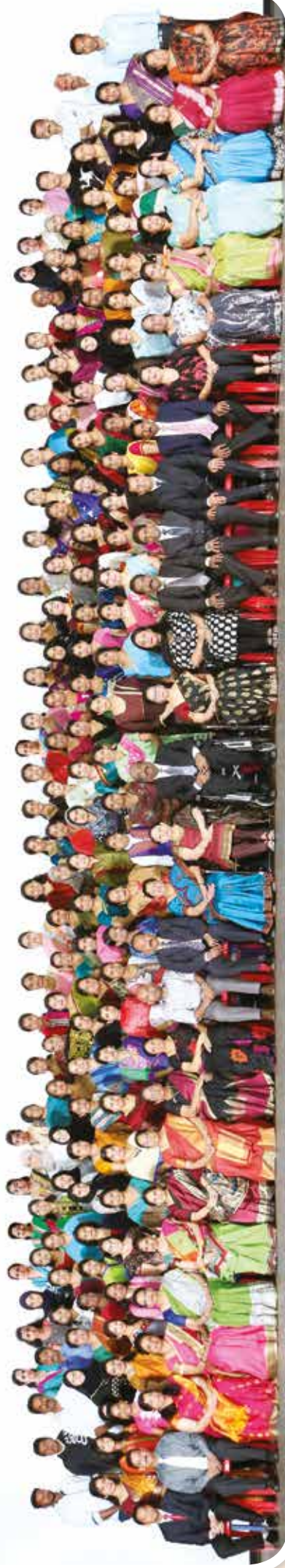
Management & Staff