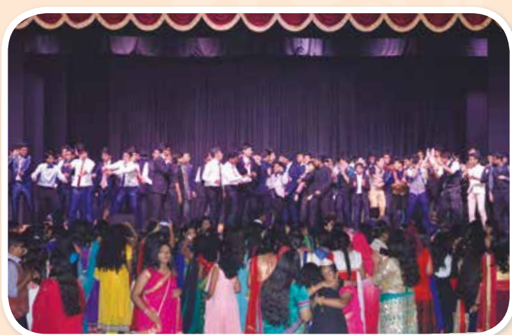
A memorable end to the event