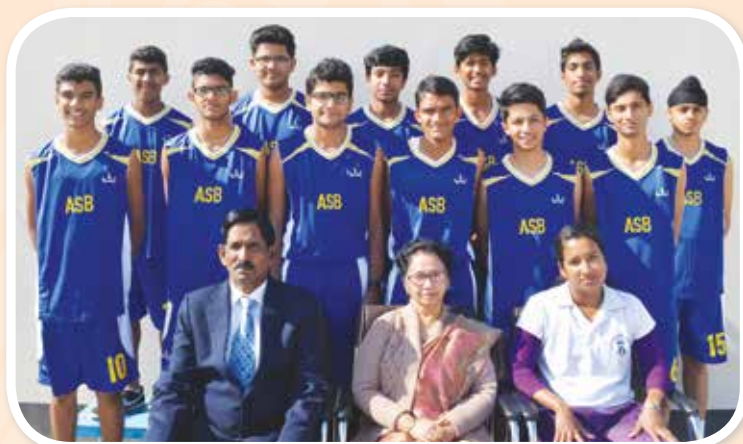
ASB Basket Ball Team