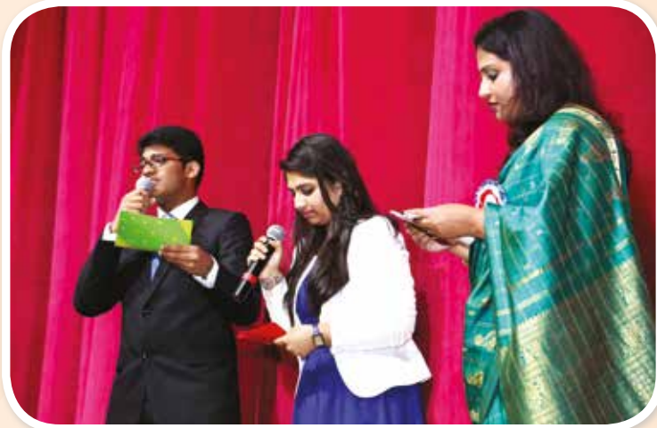
Masters of Ceremonies for both days