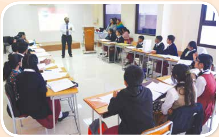
Young Leaders Programme in progress