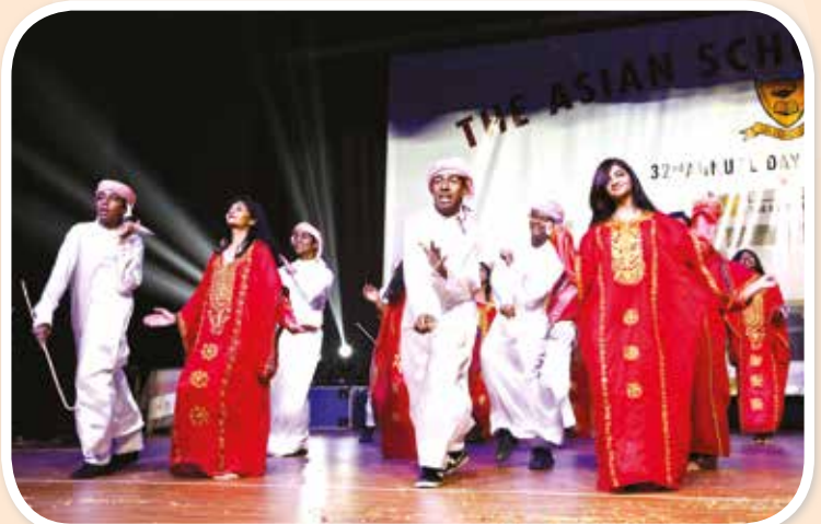
'Raqsa Shahbiya' - Arabic Dance