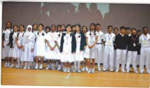
Sports - CBSE Cluster Meet Winners