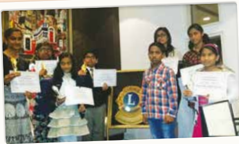
Lions Club Essay Writing and Painting Competition Winners