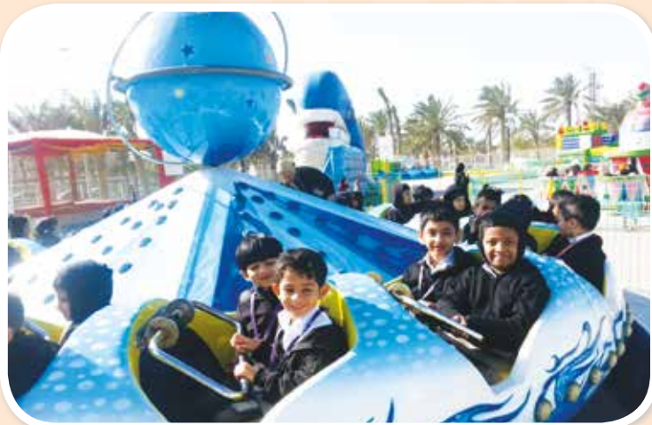
The little ones having a wonderful time at Kids Kingdom