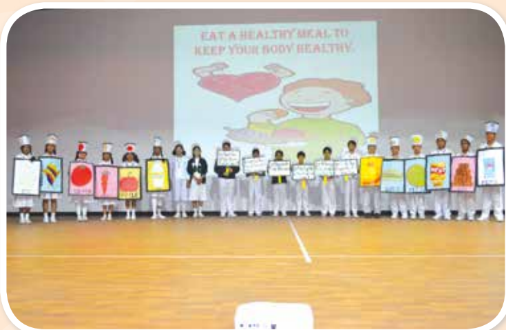
Skit on 'Your Health in Your Food' Class Assembly - Std VI