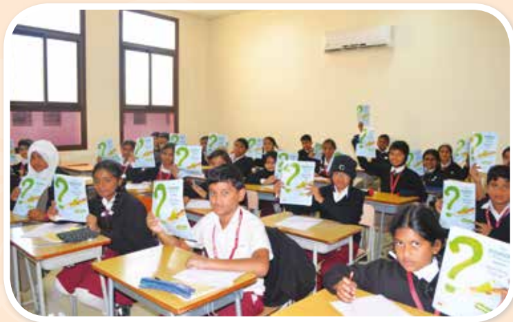
Green Olympiad Examination for Juniors