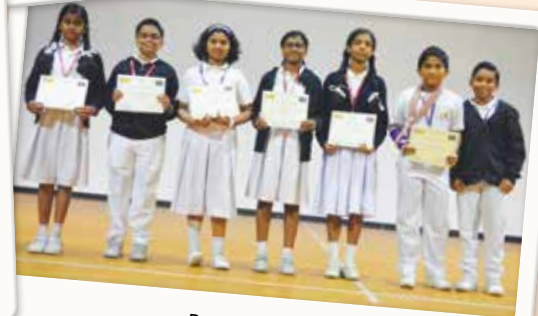
Remarkable RJ Juniors