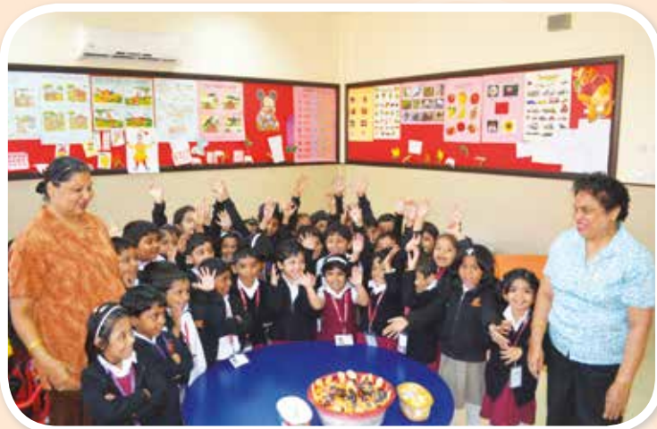
Fruit Salad Day - A sumptuous creation by our little chefs