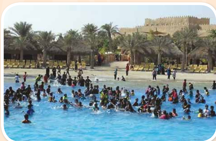
Enjoying the great outdoors at the Lost Paradise of Dilmun