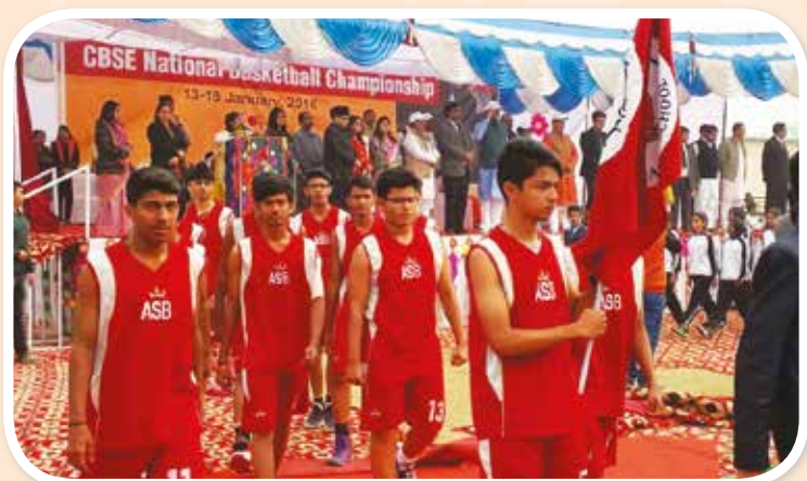
The School Basketball team at the CBSE National Basketball Championship at Sonapat, Haryana, India