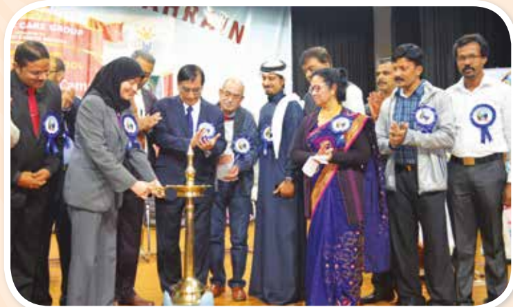
Cancer Awareness Campaign - Lighting of the lamp by Chief Guest Dr.Raja Al Yousuf, Deputy Chief of Medical Staff, Salmaniya Medical Complex