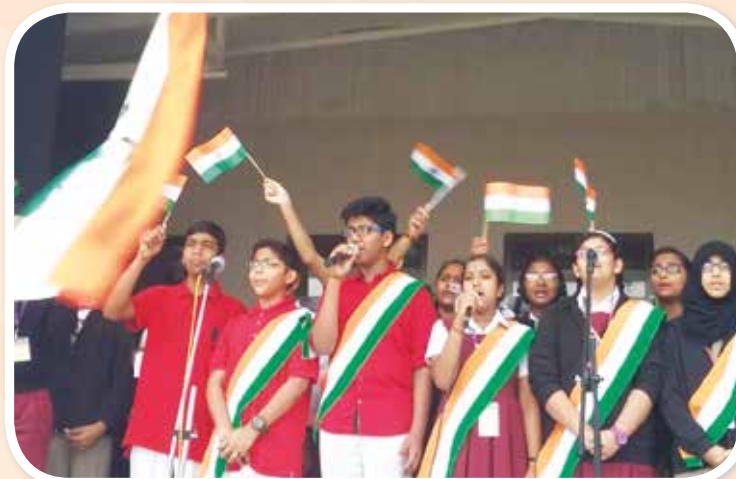
Republic Day Programme