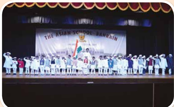
Chacha parade -Children's Day