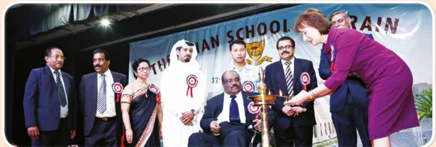
Inaugural lighting of the lamp by esteemed dignitaries