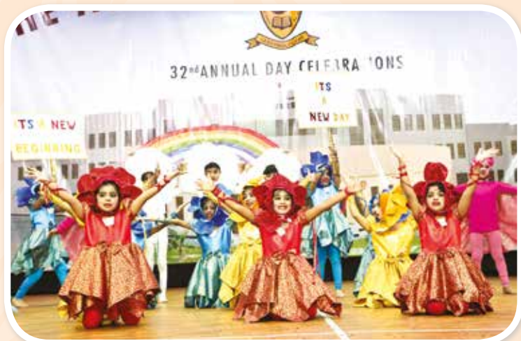
It's a beautiful day...