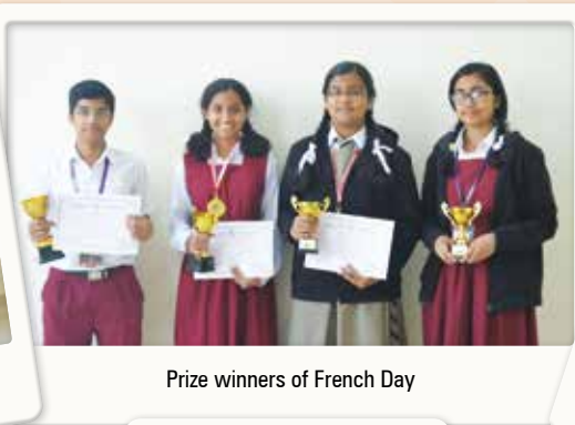
Prize winners of French Day