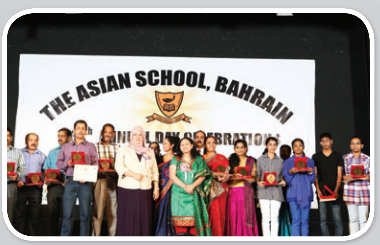
Blossoms of Glory-CBSE Toppers & Parents