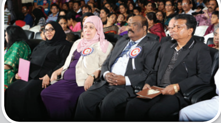
Ceremony made graceful with their presence - Our Guests