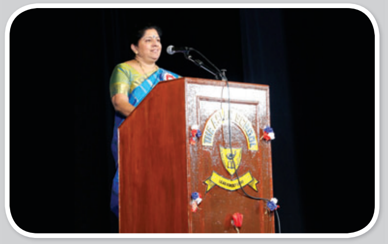
An expression of gratitude-Vote of thanks by our Vice-Principal