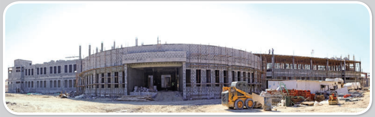
Full frontal panorama