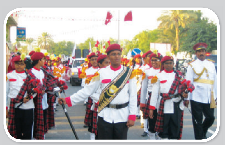
National Day procession led by the school band at Um-Al-Hassam

Campus News-Dec2013.indd 12 12/14/13 4:46 PM