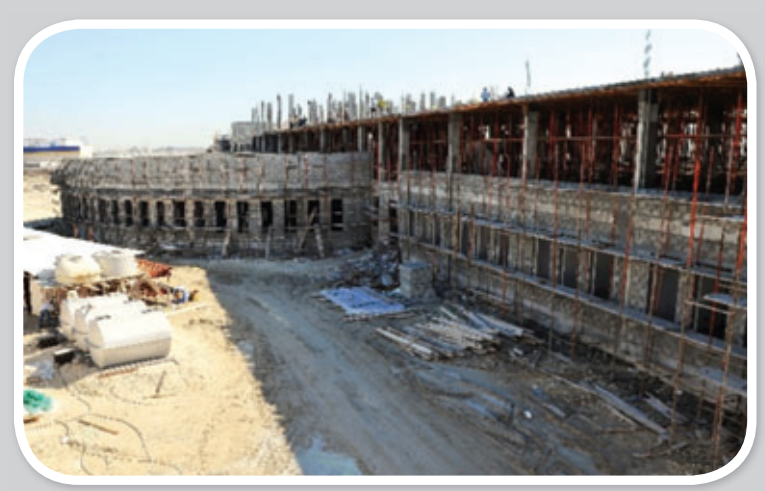
Side profile of the building