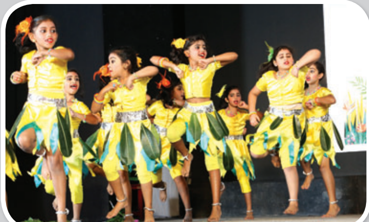
Freaky Folk Fiesta