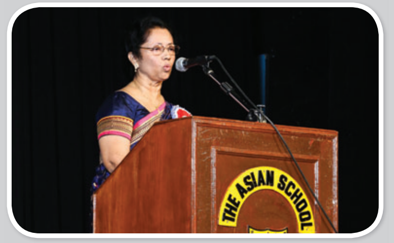
Chronicle of Accomplishments-Annual report by our Principal