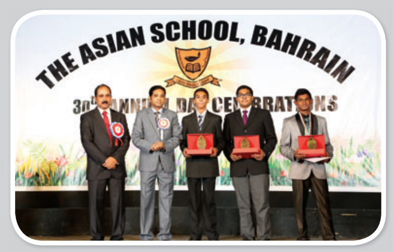
Sweet are the fruits of labour-Creators of the Annual Day Powerpoint Presentation