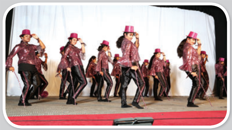
Indo - Iberian

Campus News-Dec2013.indd 11 12/14/13 4:46 PM