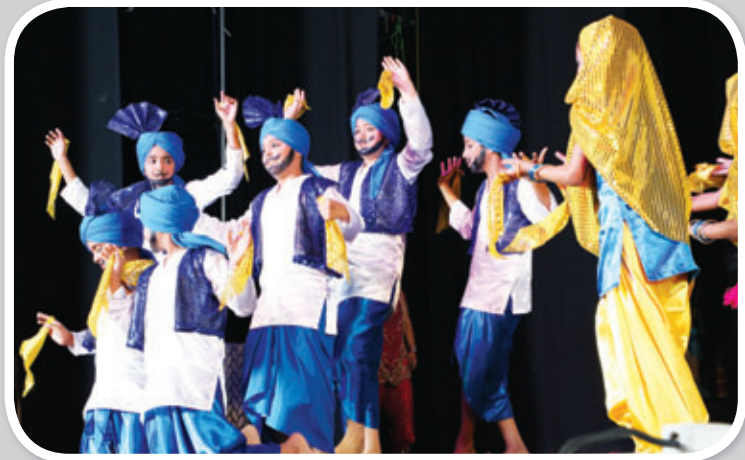
Jashn 'e' Punjab