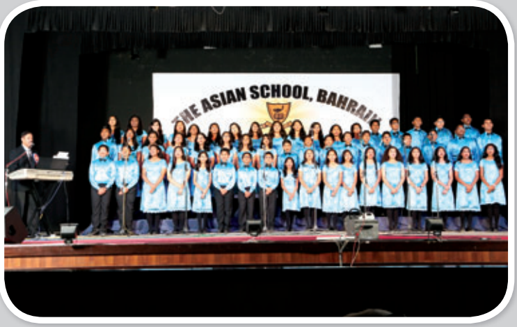
One World One Voice

Campus News-Dec2013.indd 6 12/14/13 4:46 PM