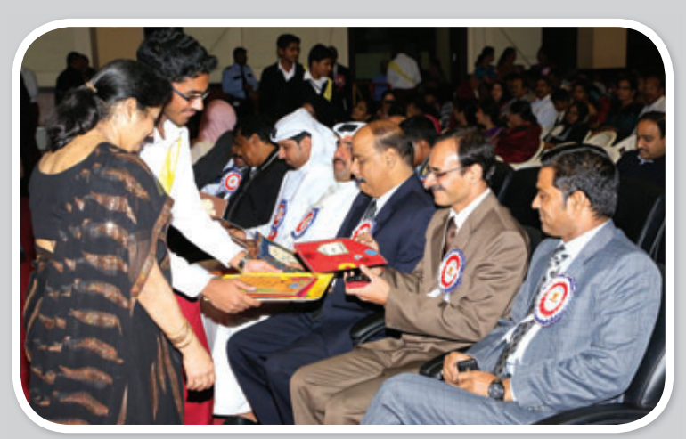
Programme dockets to our invitees