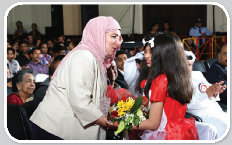
Happy Days are here again with His blessings