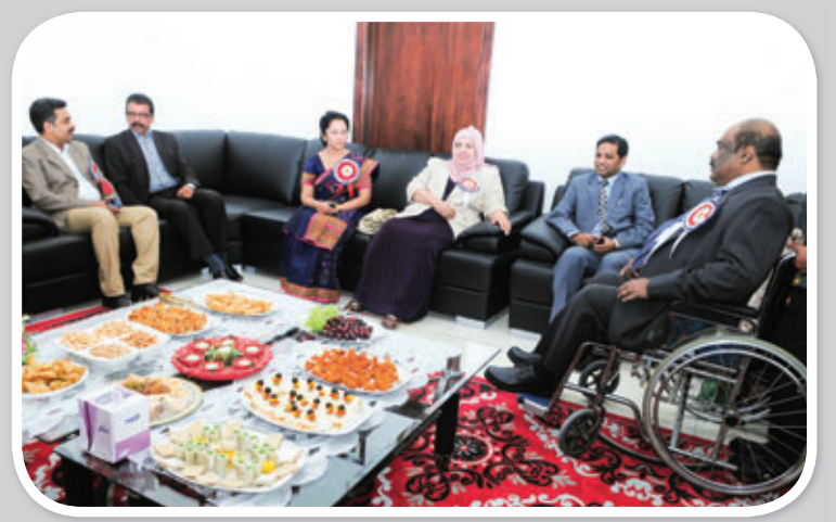
A little refreshment

Campus News-Dec2013.indd 3 12/14/13 4:46 PM