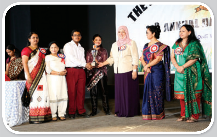
Ruby House bagged the Discipline Trophy for the year 2012-13