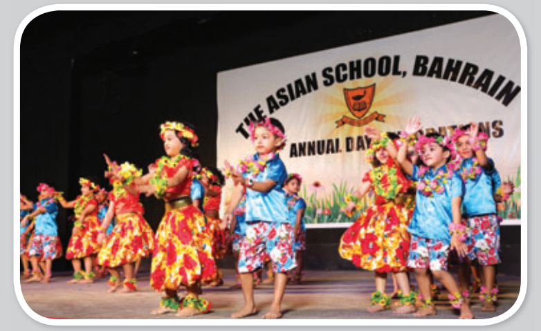
Jubilant Tots Rap

Campus News-Dec2013.indd 5 12/14/13 4:46 PM