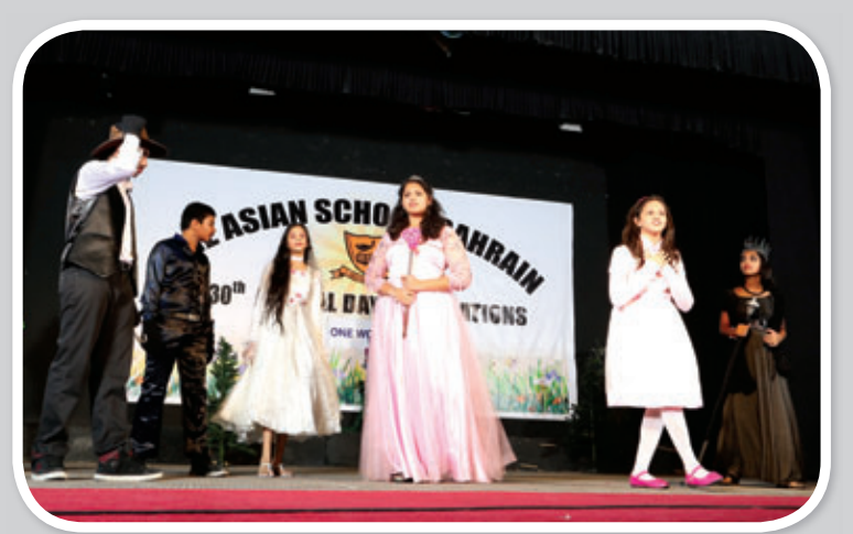
Falling Stars-English Play