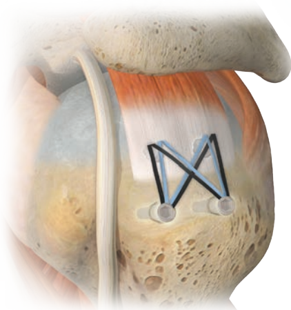
Knotless rotator cuff repair with the JuggerKnot All-Suture Anchor with Non-Sliding BroadBand Tape