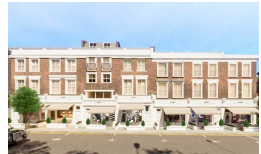
Computer generated Imagery is indicative only.

Whatever your appetite, this unique parade caters for your every whim. Home to fabulous food outlets and boutique brands, you can access Mediterranean and Asian restaurants set alongside Greek healthy homemade dishes. From conceptual cafes to fine dining (also providing workshops for adults and children to create their own dishes), it is a smorgasboard of culinary delight.